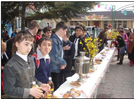
End of school year festival in 2009

Just as the opening of the Russian school year is an important event in the life of every town, the conclusion of the school year is also marked by special events. Each spring, students from all of Arkhonskaya's schools, their parents, and the teachers gather for a picnic in the village's culture park. The occasion is marked not only by an abundance of food but also by music and speeches which emphasize the important role played by Arkhonskaya's school in making it possible for young people to have the skills needed to be productive members of this community.