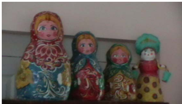
Locally produced nesting dolls

throughout the region. Another locally produced item, one that has long been synonymous with Russian culture, is the matryoshka or “nesting doll”. These dolls are typically made of wood from the linden tree, painted in accordance with the appropriate local artwork, and aged for two years to ensure durability. The ability of Arkhonskaya's youth to practice this art represents an important skill in the production of popular Russian crafts. 5