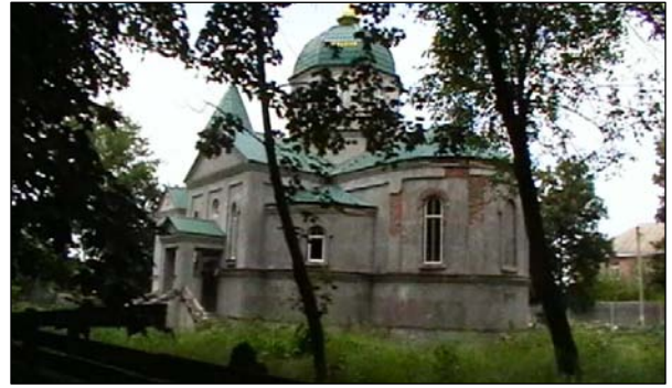
St. Alexander Nevsky Church

order to realize their dream of having a functional church. While the overwhelming majority of village residents are Orthodox Christians, there is also a small Muslim community. No other religious communities are represented in Arkhonskaya.