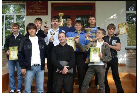
Participants display course certificates

to offer this instruction for Arkhonskaya's young boys. As the program draws to an end, participants receive the certificates ( pictured on the right ) which attest to their completion of the instructional program and their possession of skills which will help qualify them for Cossack membership in the future. Many of those completing the course become members of the Terek Cossacks.