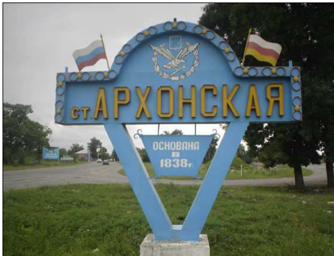
Sign at entrance to Arkhonskaya

Given the region's favorable climate and soil conditions, it is not surprising that most residents are employed in agriculture and that agriculture is the most important and profitable local industry. Yet, Arkhonskaya is more than a farm community and there are other occupations. For example, there are many people who benefit from Russia's economic reforms and have their own