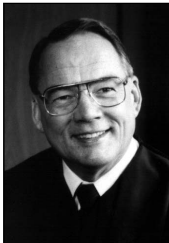
JUDGE LYLE E. STROM