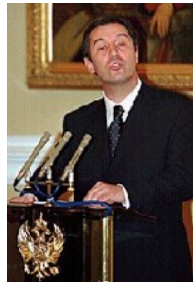
Milo Djukanovic, President of Montenegro