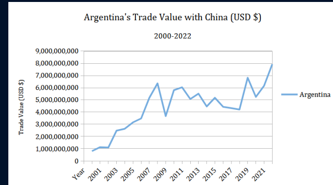
Figures 1 & 2. Data from UN Comtrade.