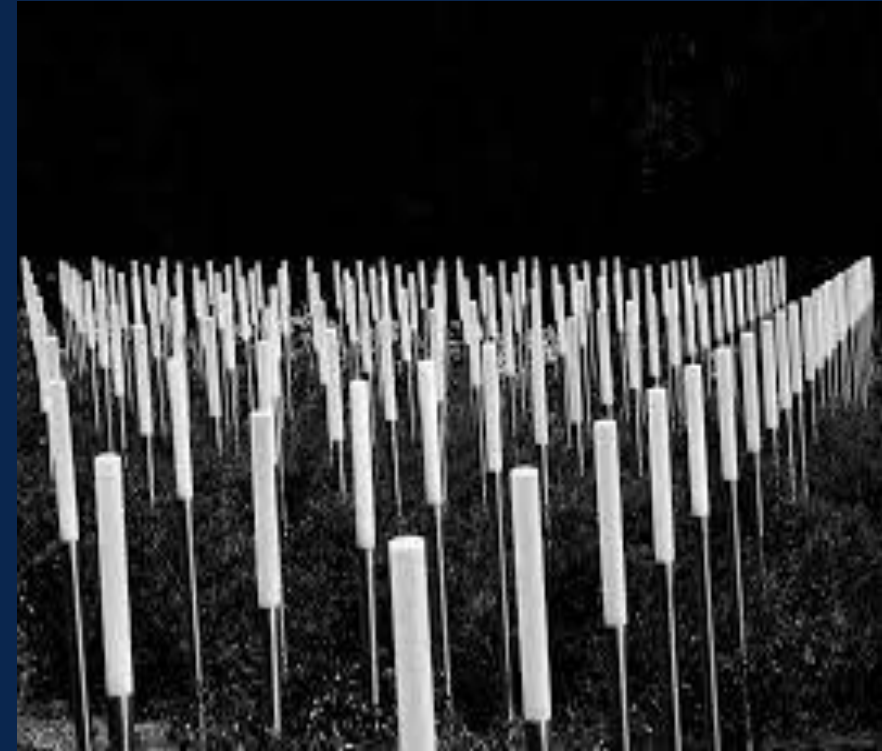
Figure 8: "Am Spiegelgrund Memorial." https://www.flickr.com/photos/kluge/15305523732 .