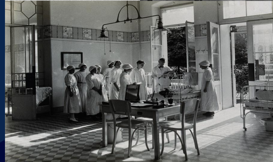
Figure 5: "University Children's Hospital, Vienna." https://commons.Wikimedia.org/wiki/File:University_Children's_Hospital_Vienna_doctors_and_nurses_i_Wellcome_V0029027.jpg .