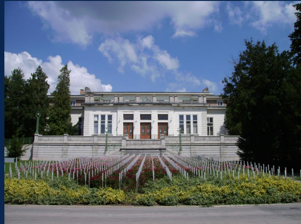
Figure 7: "Otto Wagner. Am Steinhof." https://commons.wikimedia.org/wiki/File:Otto_Wagner,_Am_Steinhof_0088.JPG .