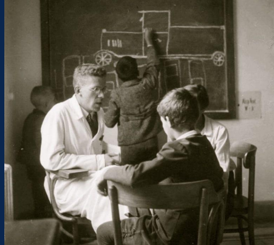
Figure 6: "Dr. Hans Asperger with a young boy at the Children's Clinic at the university of Vienna in the 1930s." https://www.npr.org/sections/health-shots/2016/01/20/F463603652/was-dr-asperger-a-nazi-the-question-still-haunts-autism .