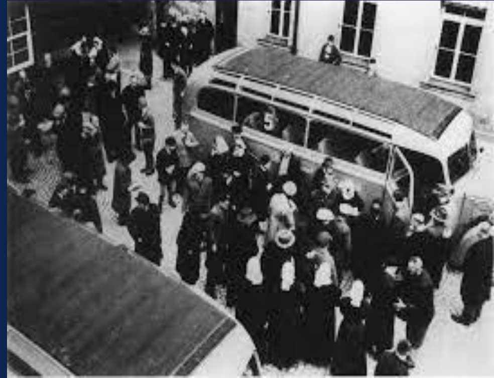
Figure 2: "Aktion T4 (Diakonie Neuendettelsau)."