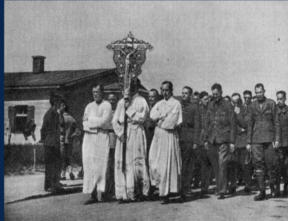
Figure 1: "A Roman Catholic Service." https://www.pegasusarchive.org/pow/General/PicFrenchCatholics.htm .