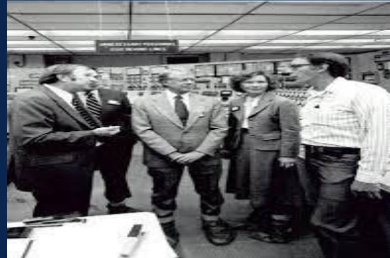
Figure 3: "President Carter Visits TMI-2 in 1979."