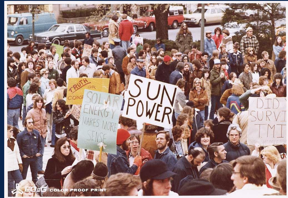
Figure 5: “Crowd at Rally. Anti-Nuke Rally in Harrisburg (Pennsylvania) at the Capitol.” https://jenikirbyhistory.getarchive.net/media/crowd-at-rally-anti-nuke-rally-in-harrisburg-pennsylvania-at-the-capitol-nara-674d77 .