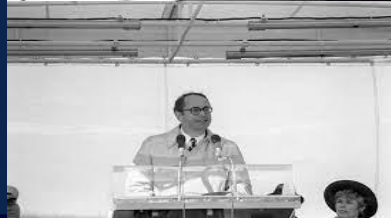
Figure 4: "Mr. Dick Thornburgh."