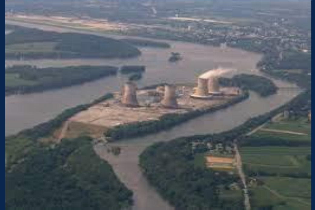
Figure 2: "Three Mile Island."