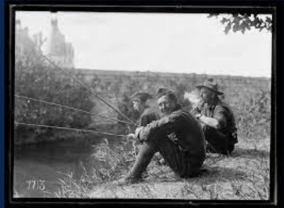
Figure 6: "Shell Shock Patients Having a Happy Time Fishing under the Wall of the Old Chateau." https://loc.getarchive.net/media/shell-shock-patients-having-a-happy-time-fishing-under-the-wall-of-the-old-a15540 .