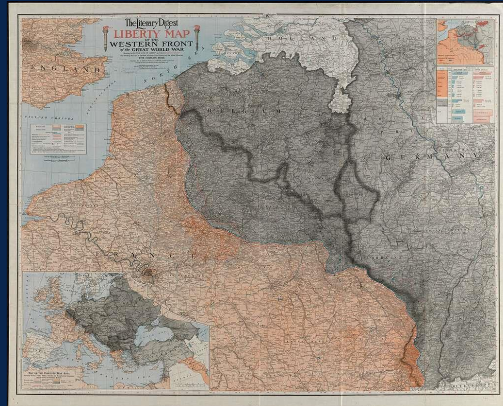
Figure 5: "The Literary Digest Liberty Map of the Western Front of the Great World War." https://garystockbridge617.getarchive.net/media/the-literary-digest-liberty-map-of-the-western-front-of-the-great-world-war-71a9f6 .