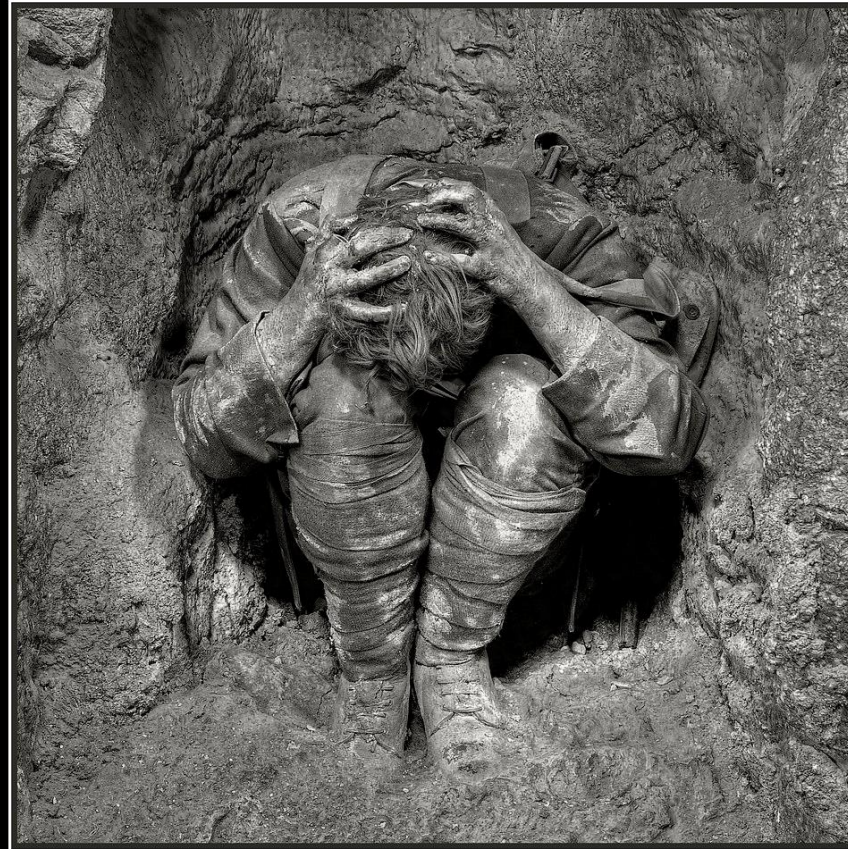
Figure 2: "Shell Shock." https://www.flickr.com/photos/ali_ba-ba/4021307637/ .