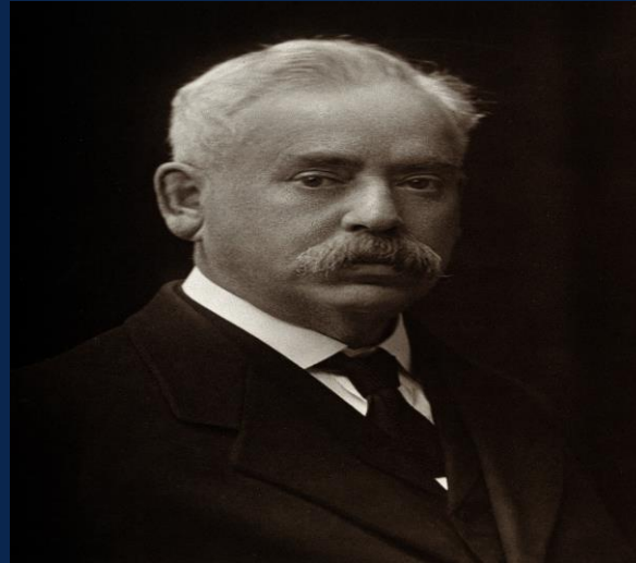
Figure 3: "Sir Fredrick Walker Mott." https://commons.wikimedia.org/wiki/File:Sir_Frederick_Walker_Mott_Photograph_by_J_Russell_%26_Sons_-_Wellcome_V0026885.jpg