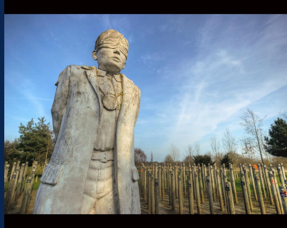
Figure 7: "Shot at Dawn." https://www.flickr.com/photos/bs0u10e0/5567766133 .