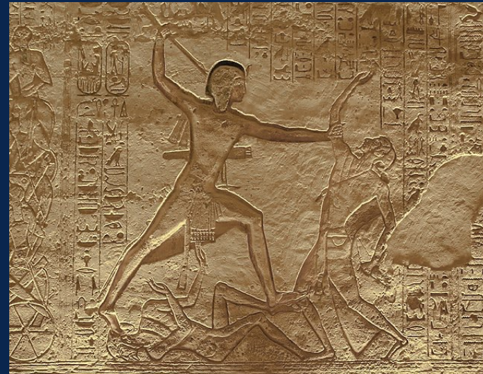
Ismoon. 2020. Ramses II Killing a Libyan Leaders. https://commons.wikimedia.org/wiki/File:Egypt_Abou_Simbel6.jpg#filehistory .