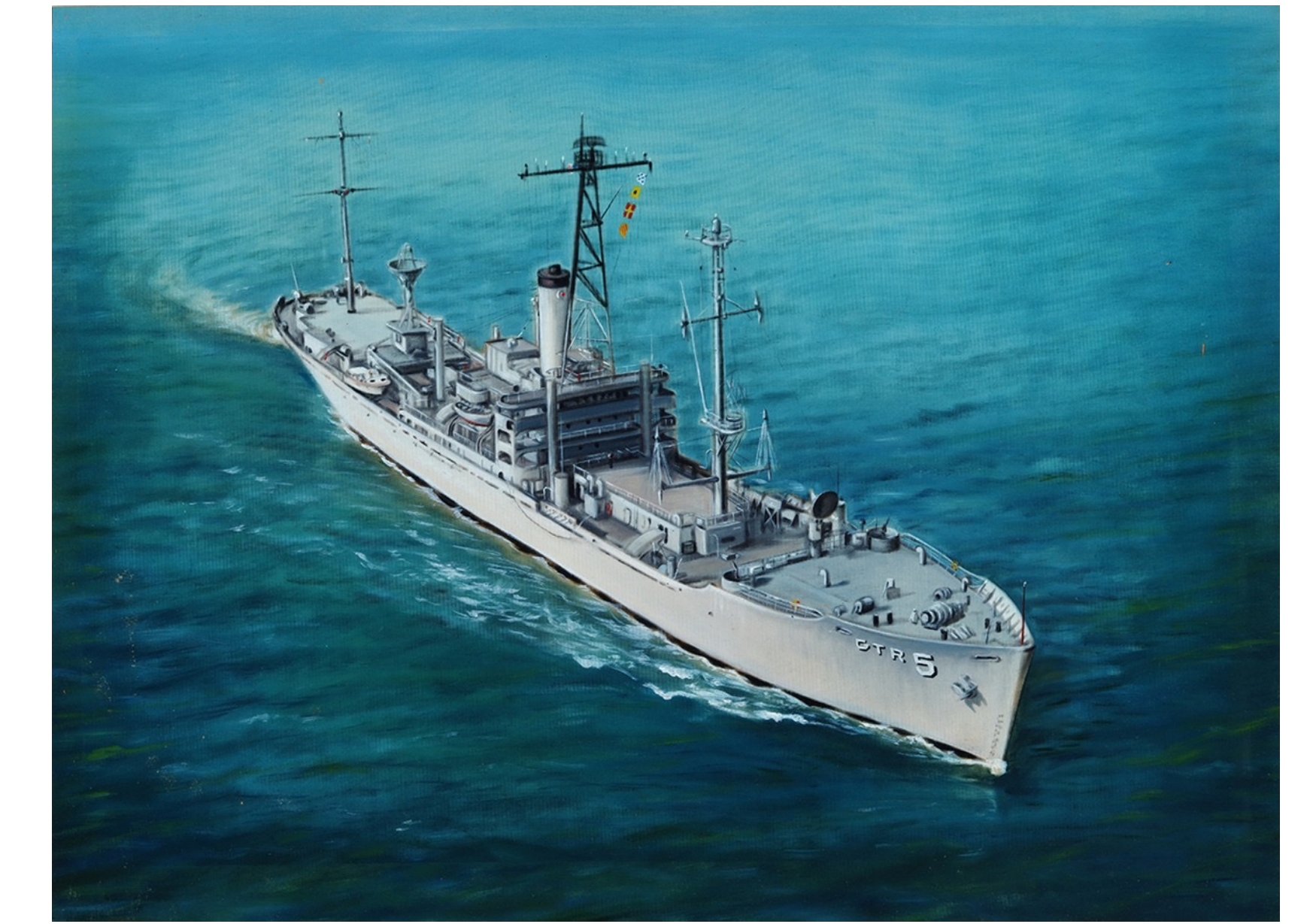
Figure 7. USS Liberty AGTR-5. Painting, Oil on Silk; Artist Unknown; C. 1967; Framed Dimensions 21H X 25W

The USS Liberty Incident remains one that is extremely complicated. The disparity between survivor accounts and official government reports remains concerning especially considering those involved in government investigation claim that the investigation of the incident was ordered to be rushed.