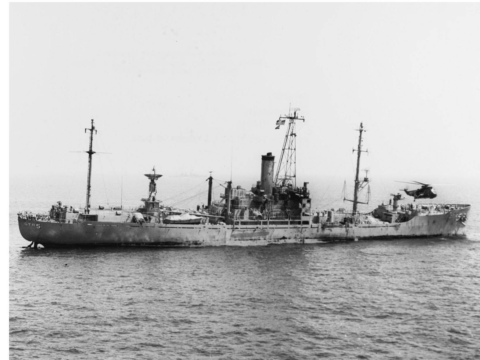
Figure 1. The U.S. Navy electronic reconnaissance gathering ship USS Liberty (AGTR-5) receives assistance from units of the U.S. Sixth Fleet after she was attacked and seriously damaged by Israeli forces off the Sinai Peninsula on 8 June 1967.