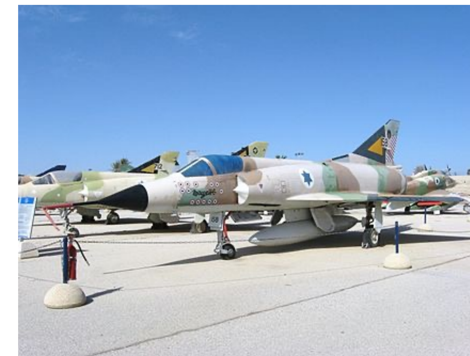
Figure 5. “Israeli Air Force Mirage IIICJ 158 at the Israeli Air Force Museum in Hatzerim”