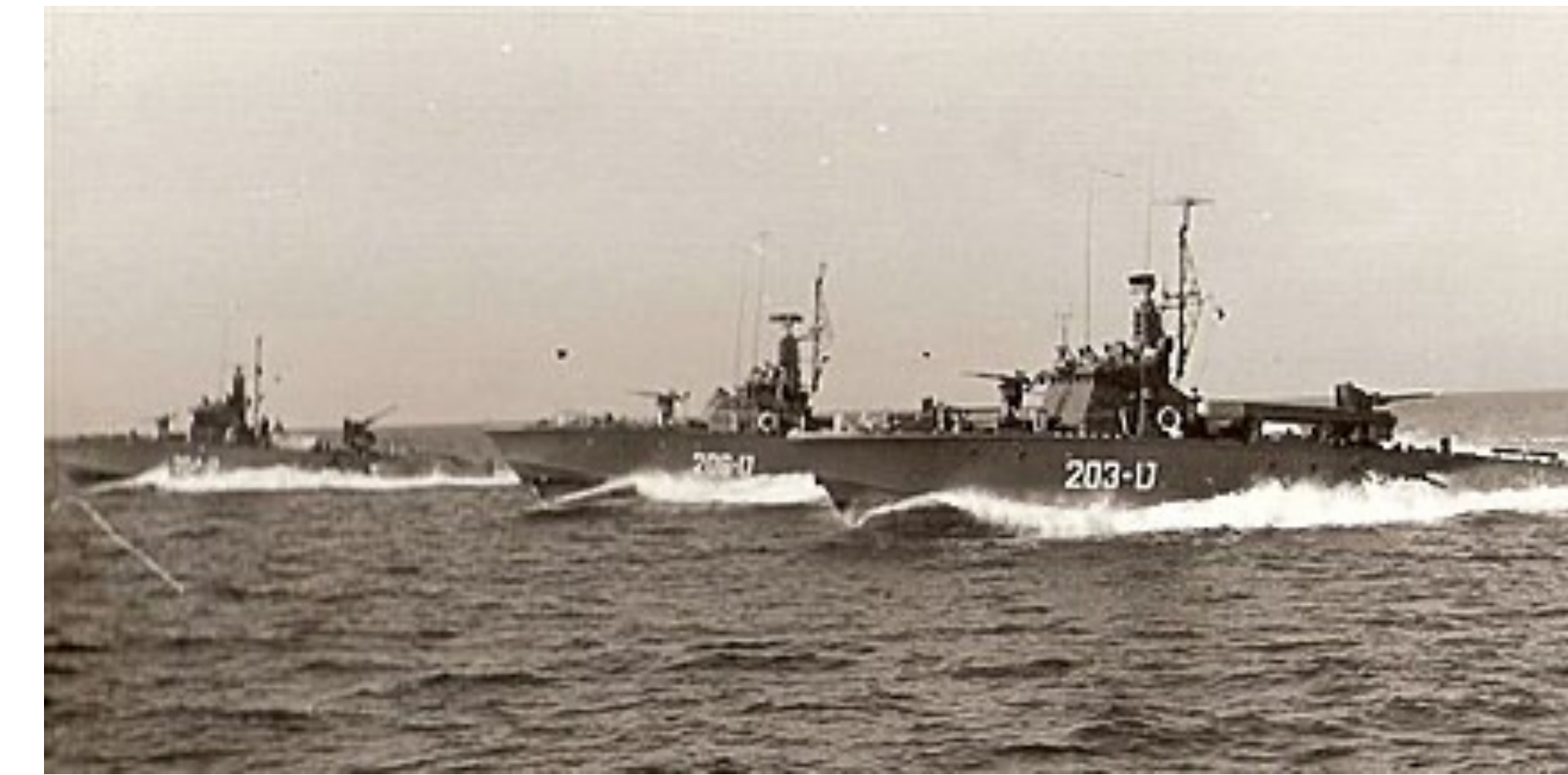
Figure 4. “Pictured are Motor Torpedo Boats of the Israeli Navy”