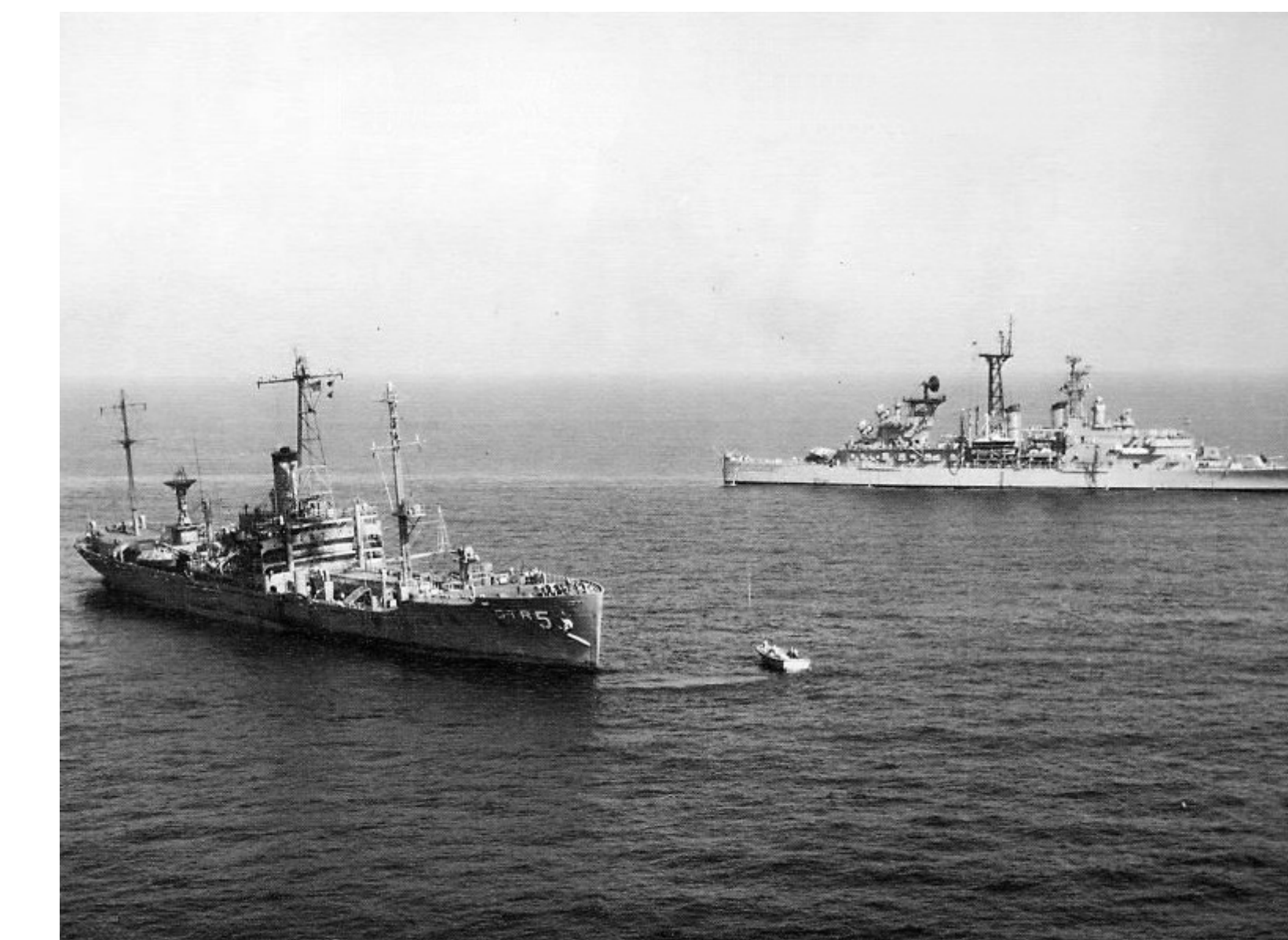
Figure 2. Picture taken of the damaged U.S. SIGINT ship USS Liberty (AGTR-5) which had been damaged on 8 June 1967 in the Mediterranean Sea by Israeli forces during the Six Days War. The picture was taken from the U.S. aircraft carrier USS America (CVA-66). To the right is the guided missile cruiser USS Little Rock (CLG-4), flagship of the 6th Fleet. June 8, 1967.