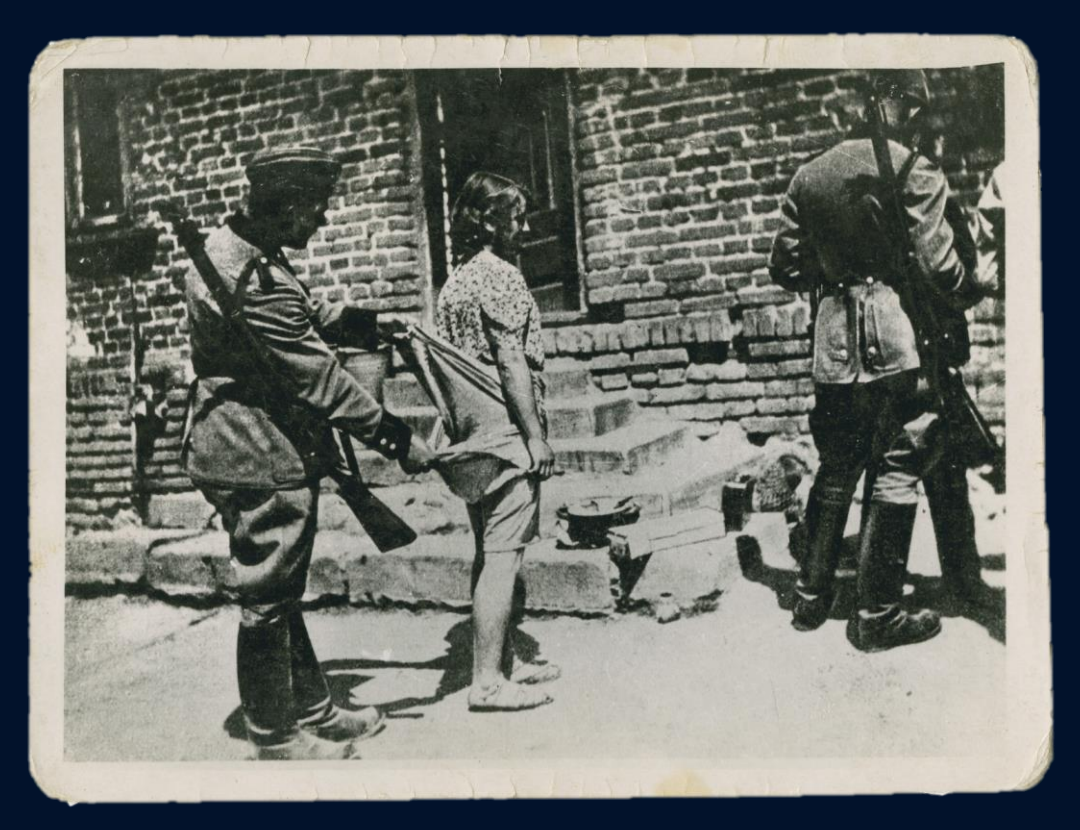
Figure 7: An armed Nazi searches a woman by pulling down her underwear. (An armed Nazi searches a woman by pulling down her underwear, n.d., https://collections.ushmm.org/search/catalog/pa1180296)