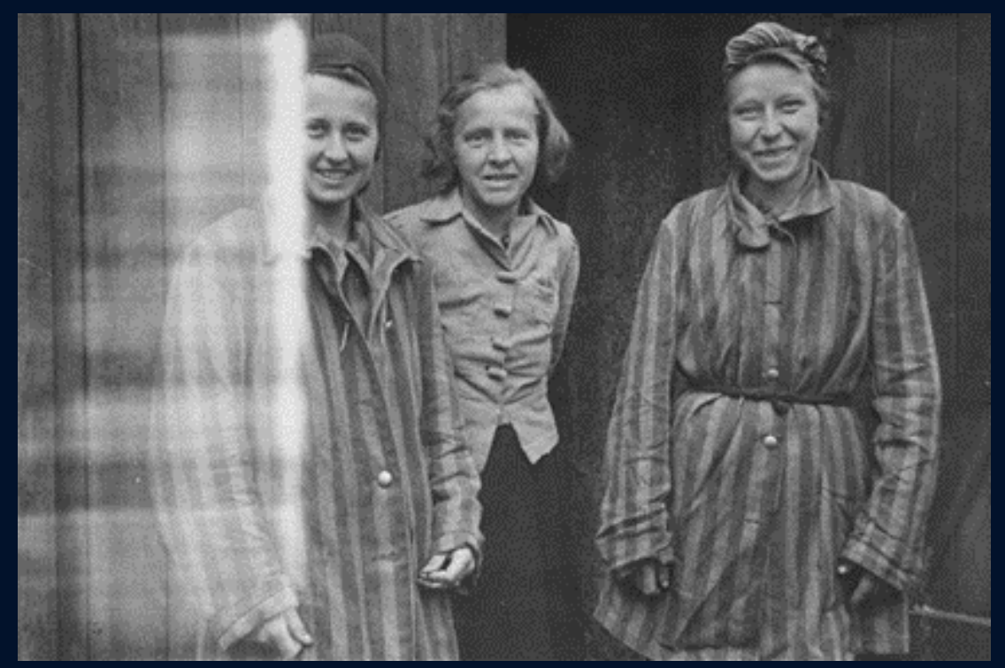
Figure 10: Liberated female prisoners in the womens' camp at Woebbelin. (Women smiling now that they have been liberated, n.d., https://collections.ushmm.org/search/catalog/pa1039411)