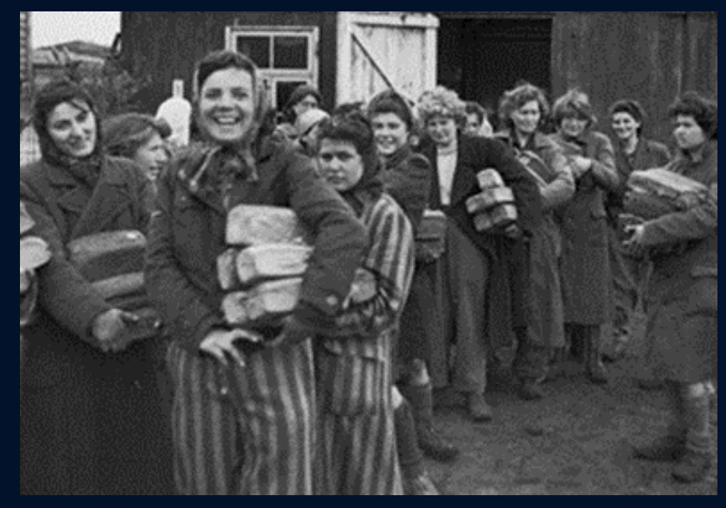
Figure 9: Prisoners of the Bergen-Belsen concentration camp cheerfully collect bread rations upon their liberation by British forces in April 1945. (Women receiving bread rations after liberation, n.d., https://www.royalnavy.mod.uk/news-and-latest-activity/news/2018/january/29/180129-holocaust-memorial-day)