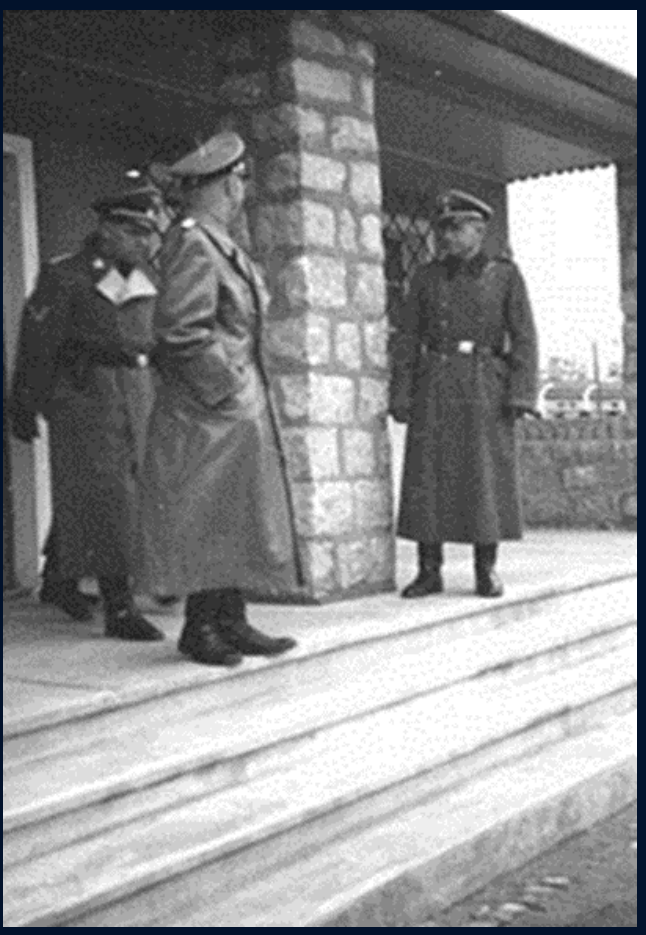
gure 4: Himmler standing on the steps of the Mauthausen concentration camp brothel in October 1941 (Himmler at e barracks, n.d., https://www.dailymail.co.uk/news/article-4976754/The-Auschwitz-BROTHEL-prisonersworlds brui)