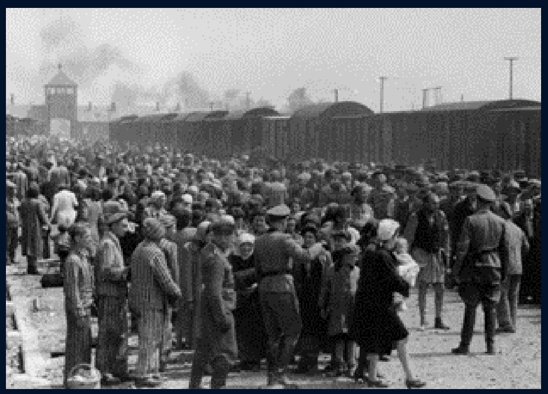
Figure 1: Nazi guards round up arriving prisoners at the Auschwitz concentration camp's unloading ramp (Masses of people getting off the trains at Auschwitz, n.d., https://en.historylapse.org/the-holocaust)