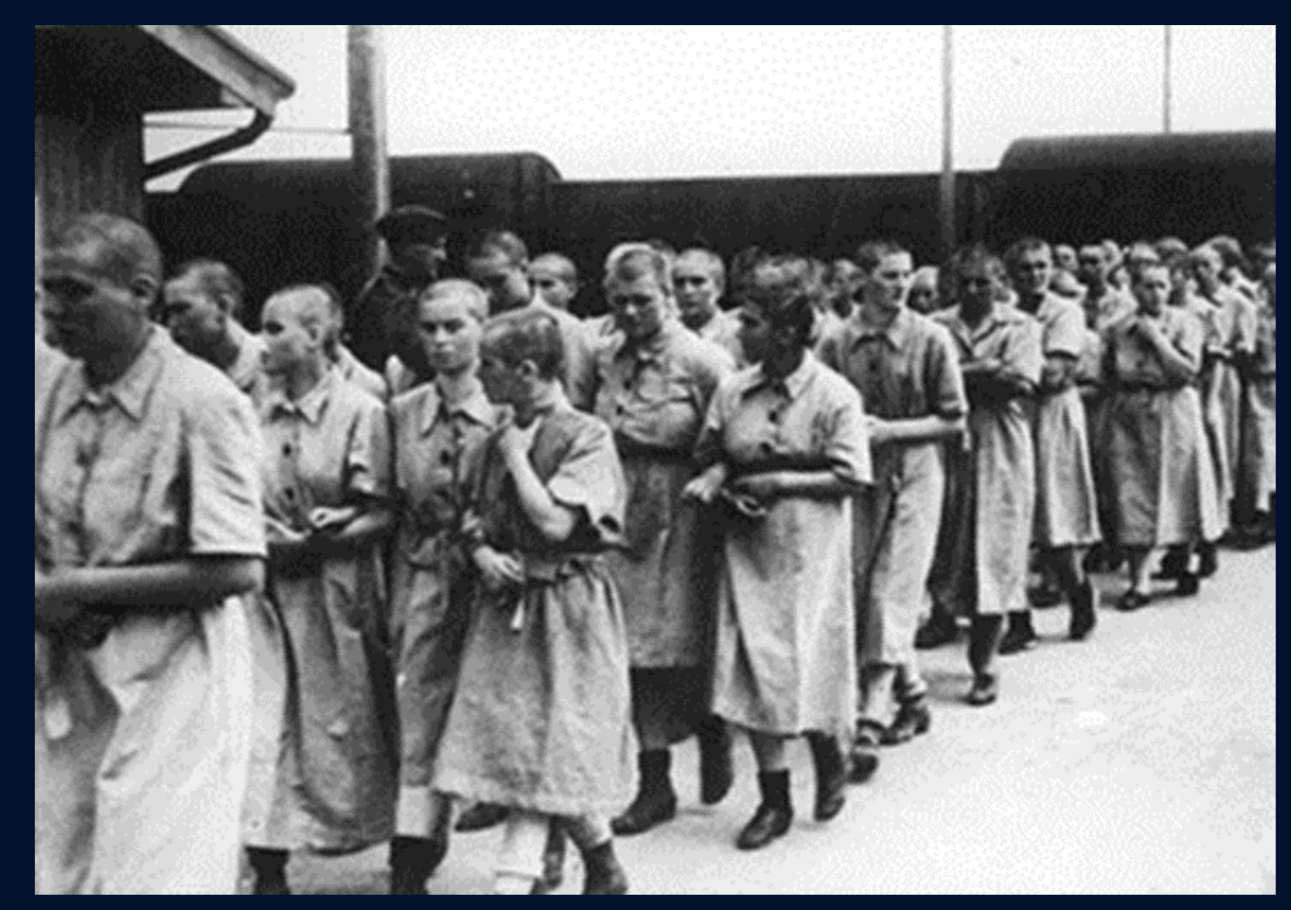
Figure 8: Female prisoners in Auschwitz, walking in lines with there heads shaven