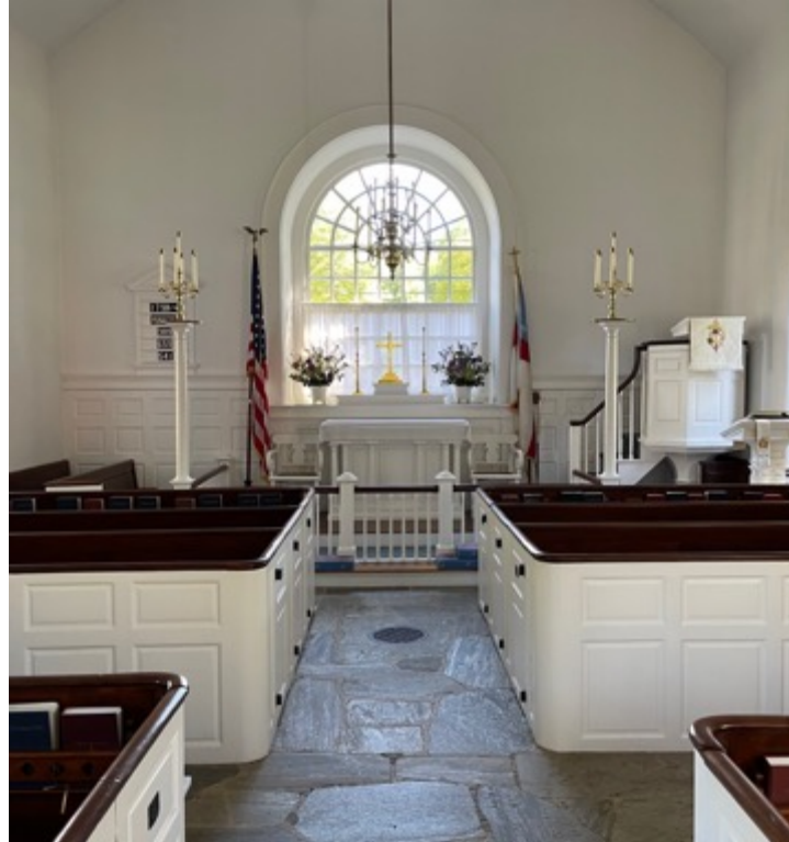
Figure 6. Altar in St. David's.