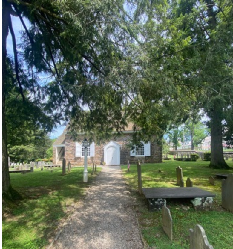
Figure 1. St. David's Church.