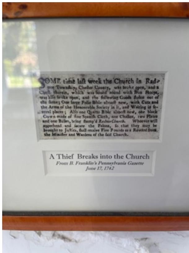
Figure 16. American Weekly Mercury.