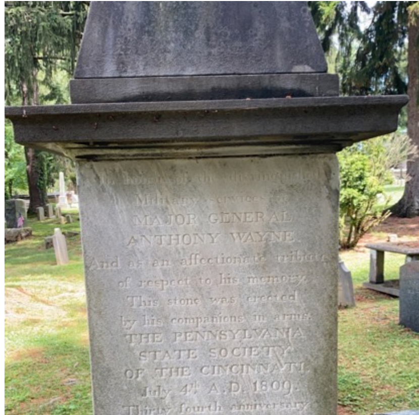
Figure 13. Grave of Gen. Anthony Wayne.