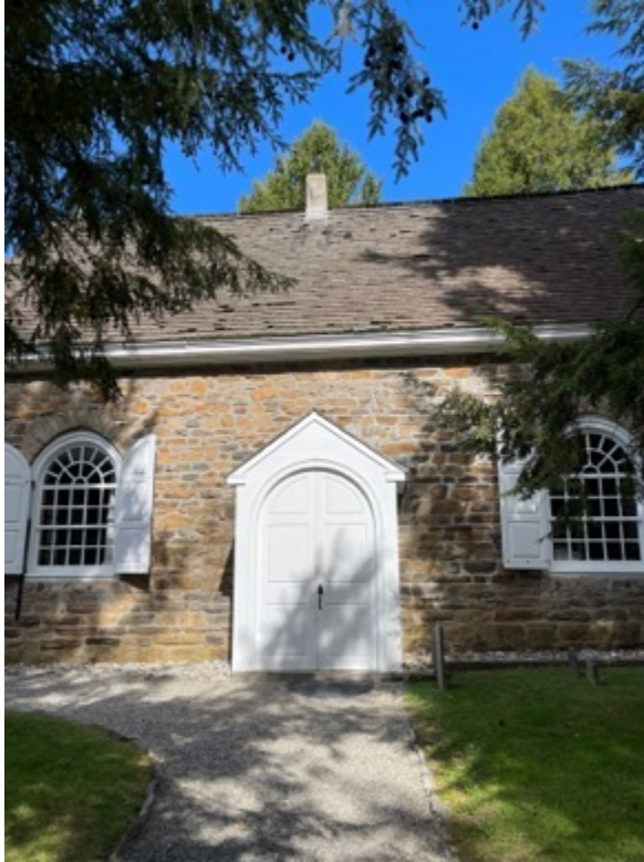
Figure 21. Exterior of St. David's.