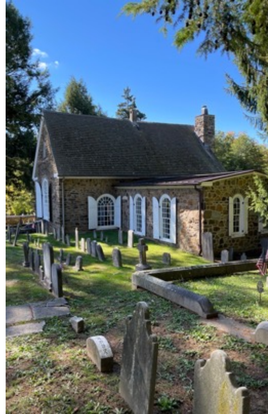
Figure 4. Exterior of St. David's Church.