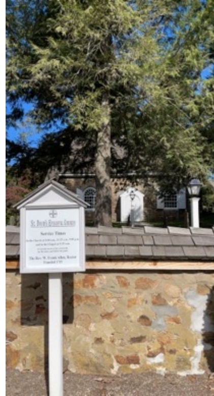
Figure 22. Exterior of St. David's.