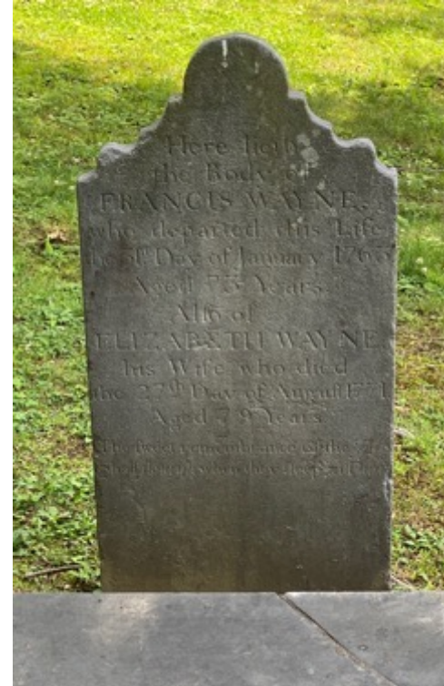
Figure 18. Gravestone in St. David's.