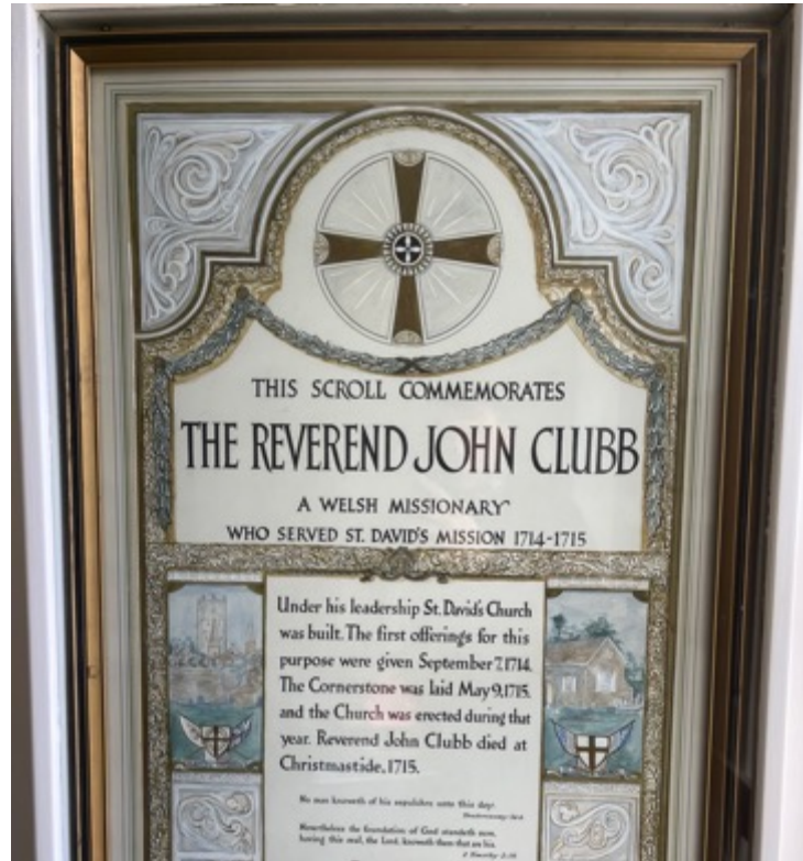
Figure 5. John Clubb Scroll (Photo by Maximus Marlowe).