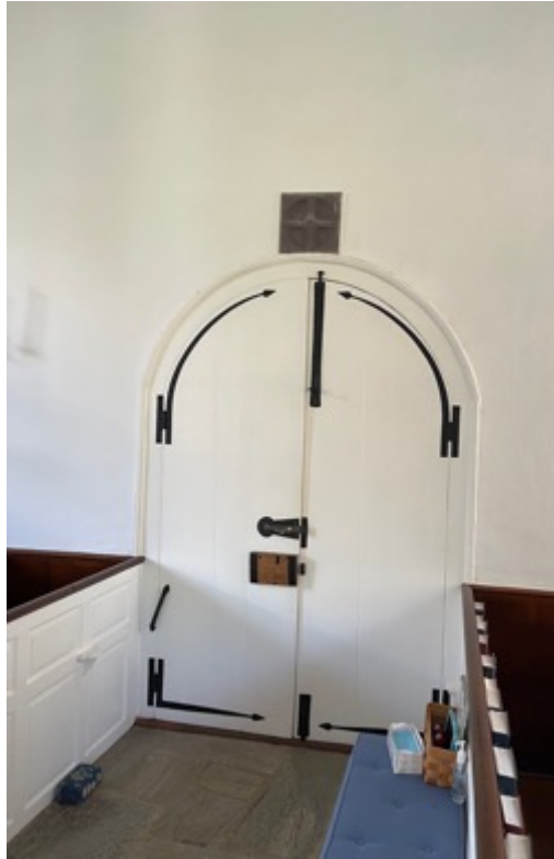
Figure 7. The Cross of St. David's.