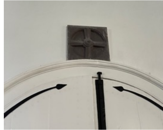
Figure 8. The Cross of St. David's.