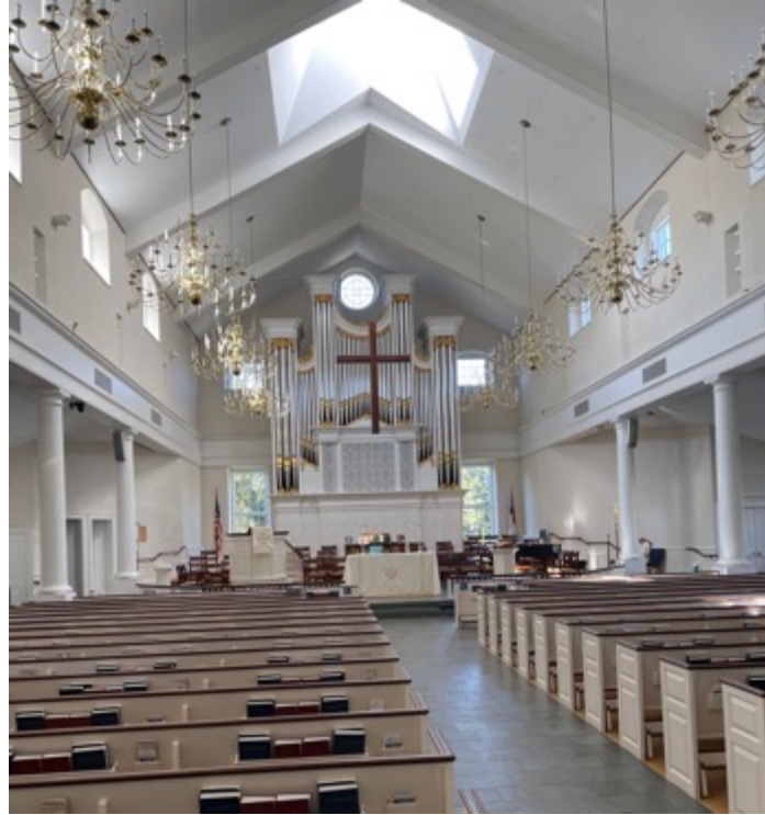
Figure 20. New St. David's (Photo by Maximus Marlowe).