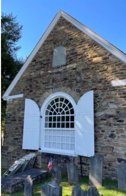
Figure 3. Exterior of St. David's Church.