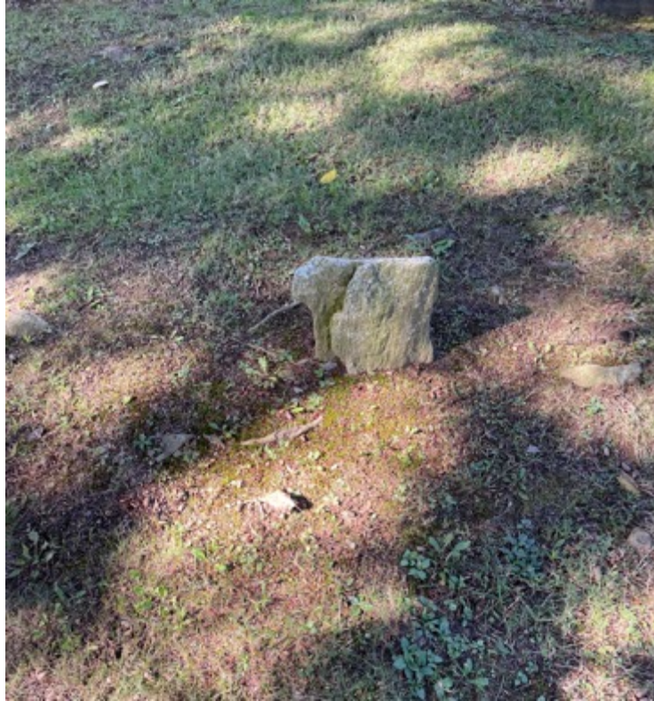
Figure 14. Lenape Grave.