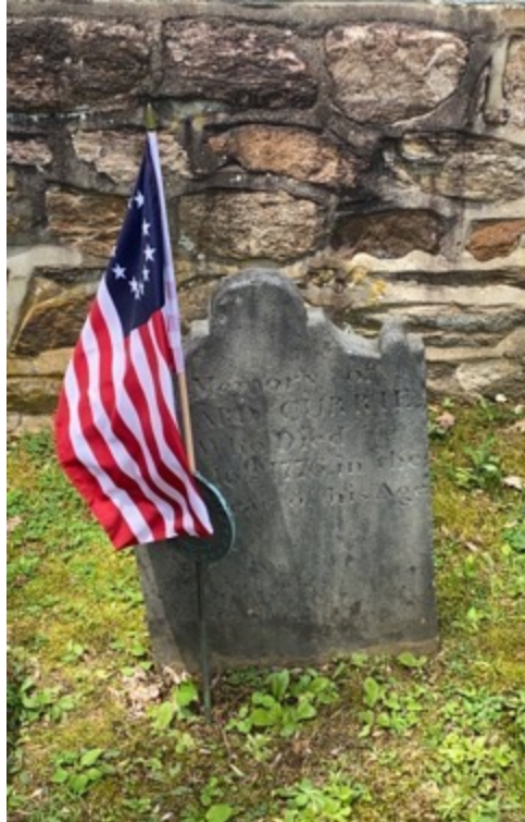
Figure 17. Revolutionary Gravestone (Photo by Maximus Marlowe).