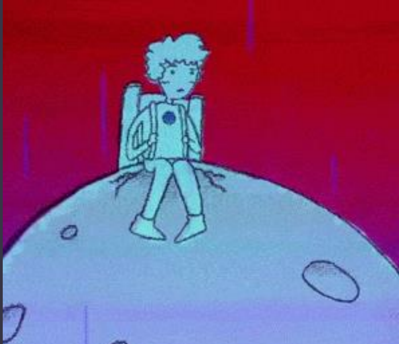
Fig. 10 “Space Kid.” Directed by PJ Liguori, YouTube, 2016.