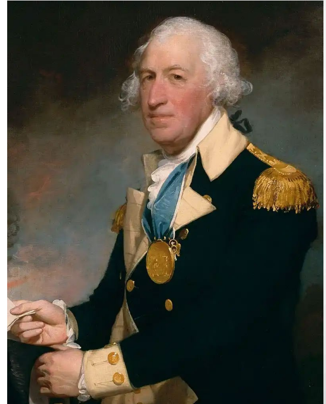
Figure 1. Gilbert Stuart, Horatio Gates , c. 1794. Creative Commons CC0 1.0 Universal Public Domain Dedication. https://en.wikipedia.org/wiki/Horatio_Gates#/media/File:HoratioGatesByStuart_crop.jpg