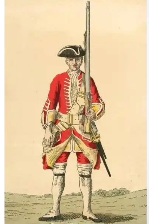
Figure 2. Unknown artist. Soldier of the 20 th regiment, 1742 . PD-old-100. https://digitalcollections.nypl.org/?num=12&parent_id=293136&word=&snum=&s=&notword=&d=&c=&f=&sScope=&sLevel=&sLabel=&imgs=12&pNum=