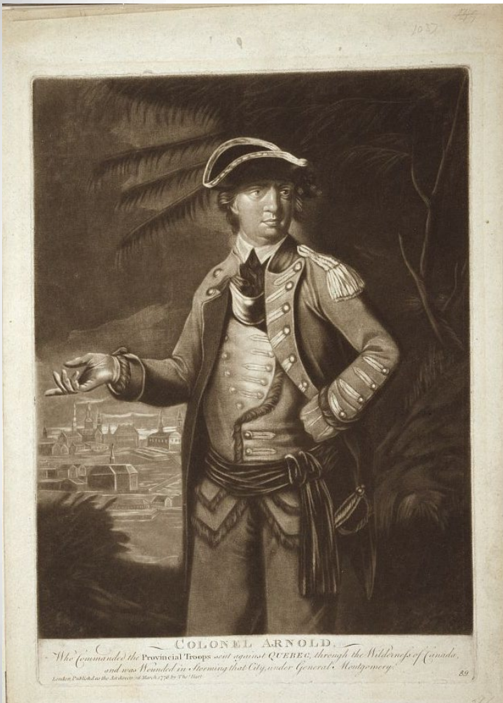
Figure 7. Colonel Arnold - who commanded the provincial troops sent against Quebec, through the wilderness of Canada, and was wounded in storming that city, under General Montgomery. United States, 1776. London: Published by Thos. Hart. Photograph. https://www.loc.gov/item/2001696987/ .