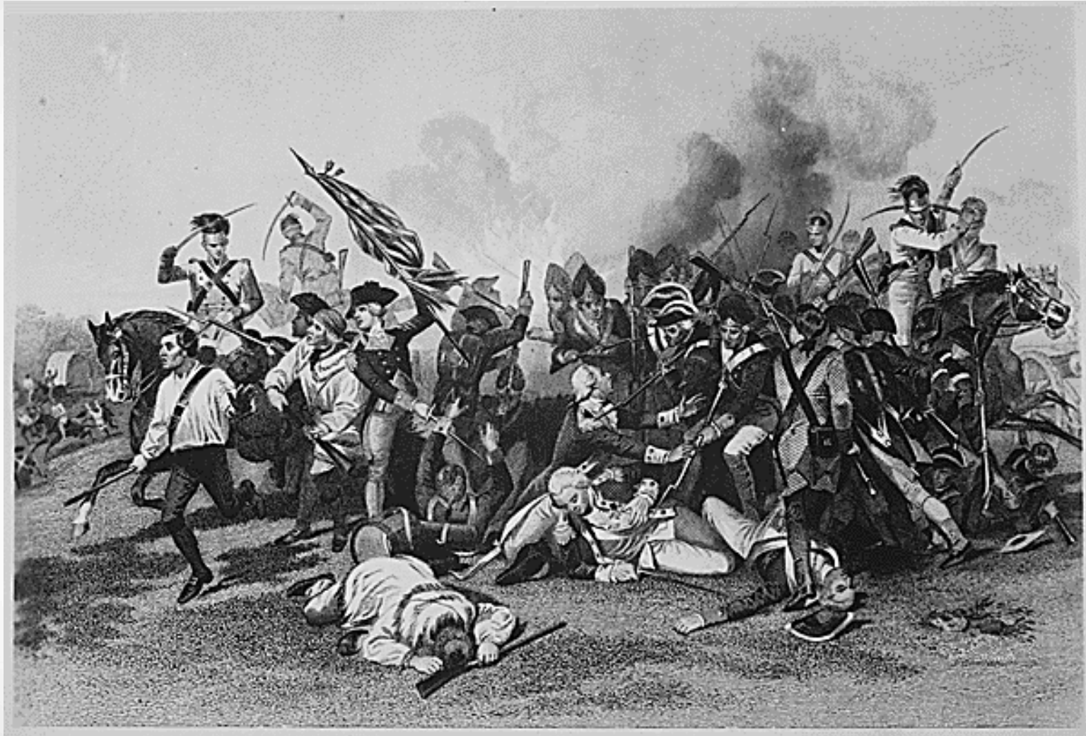
Figure 9. Chappel, Alonzo. Battle of Camden-Death of De Kalb, August 1780 . Copy of engraving, 1931. Washington DC: National Archives. https://catalog.archives.gov/id/532872?objectPage=3 .