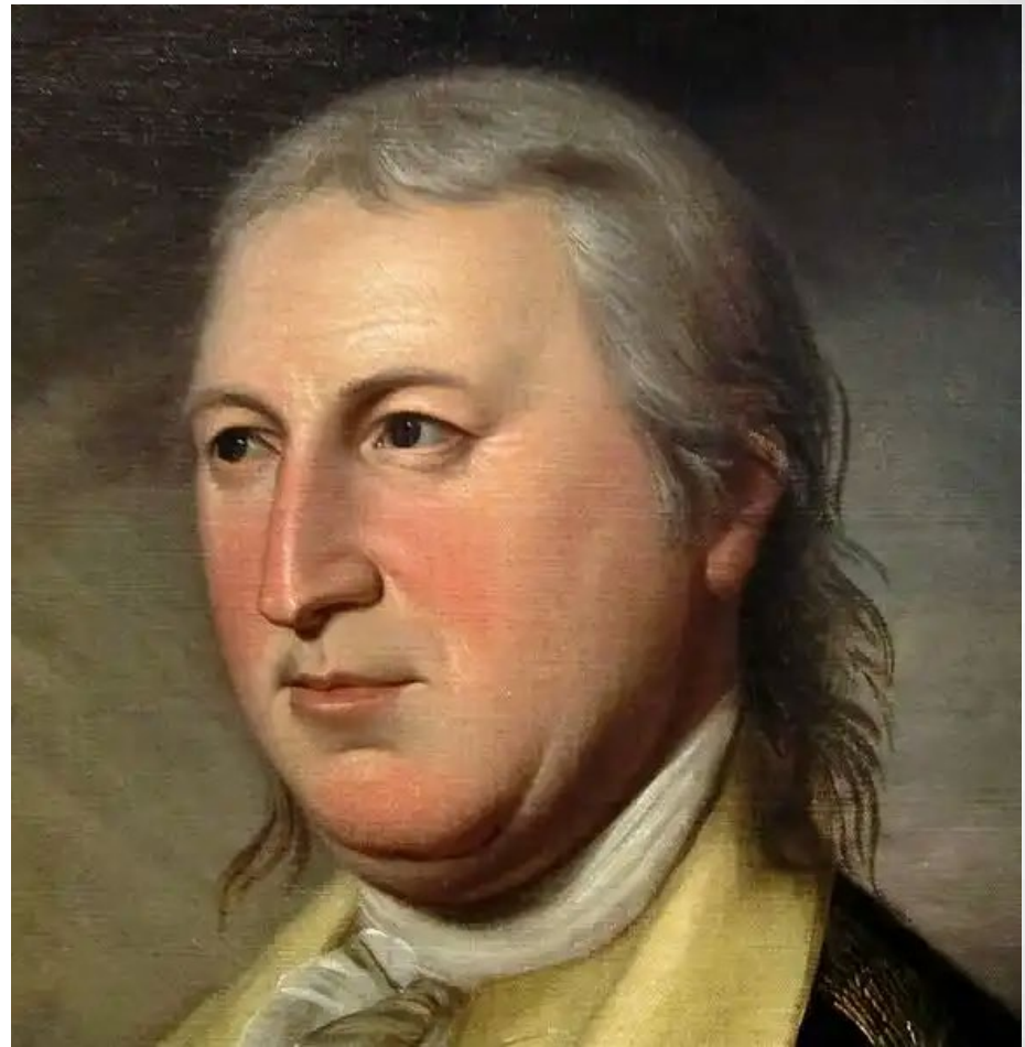
Figure 14. James Peale, Horatio Gates ca. 1782. Creative Commons CC0 1.0 Universal Public Domain Dedication, https://commons.wikimedia.org/wiki/File:Horatio_Gates_at_National_Portrait_Gallery_crop.jpg