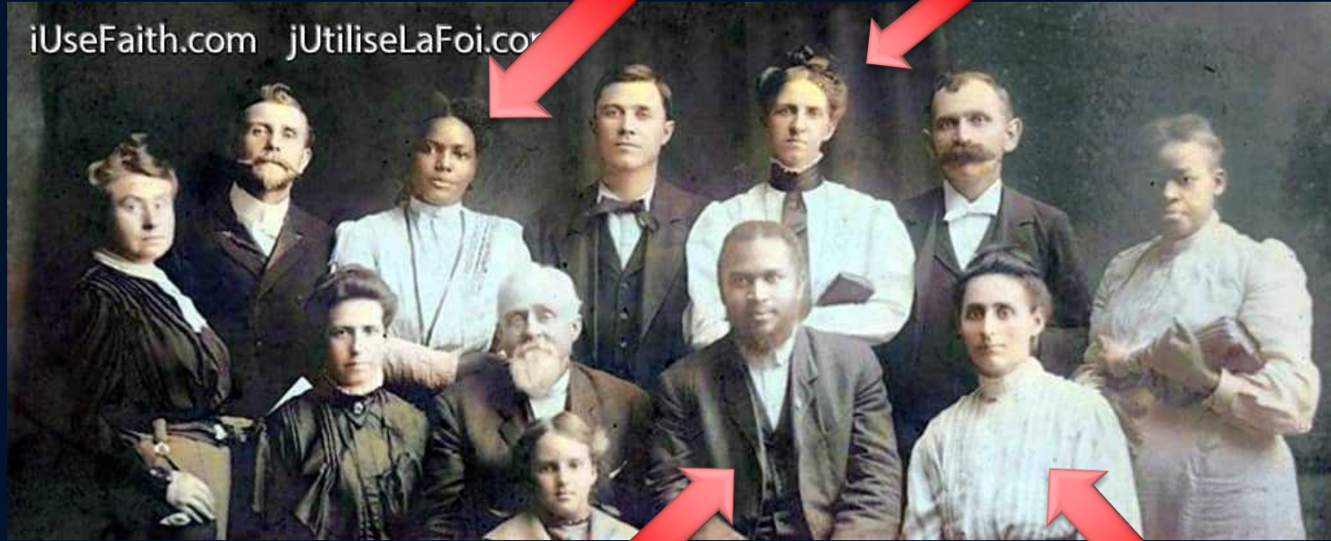
William J. Seymour