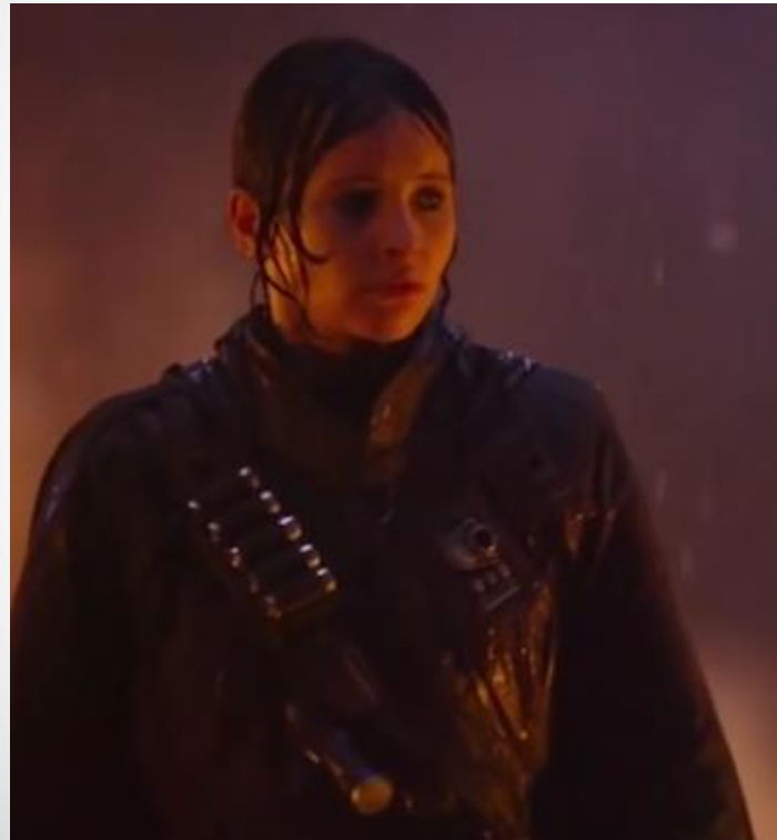
From "Star Wars Universe" by Unknown Author, n.d., retrieved from <a href="https://www.starwars-universe.com/personnage-4150-jvn-erso.html">https://www.starwars-universe.com/personnage-4150-jvn-erso.html</a>. CC BY-NC-ND.