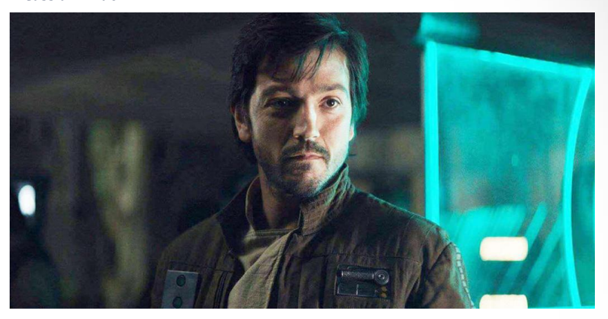
From "La serie di Star Wars su Cassian Andor ha un nuovo regista" by Paolo Armelli, 2020, retrieved <a href="https://www.wired.it/play/televisione/2020/09/23/serie-star-wars-cassian-andor-regista/">https://www.wired.it/play/televisione/2020/09/23/serie-star-wars-cassian-andor-regista/</a>. CC BY-NC-ND.