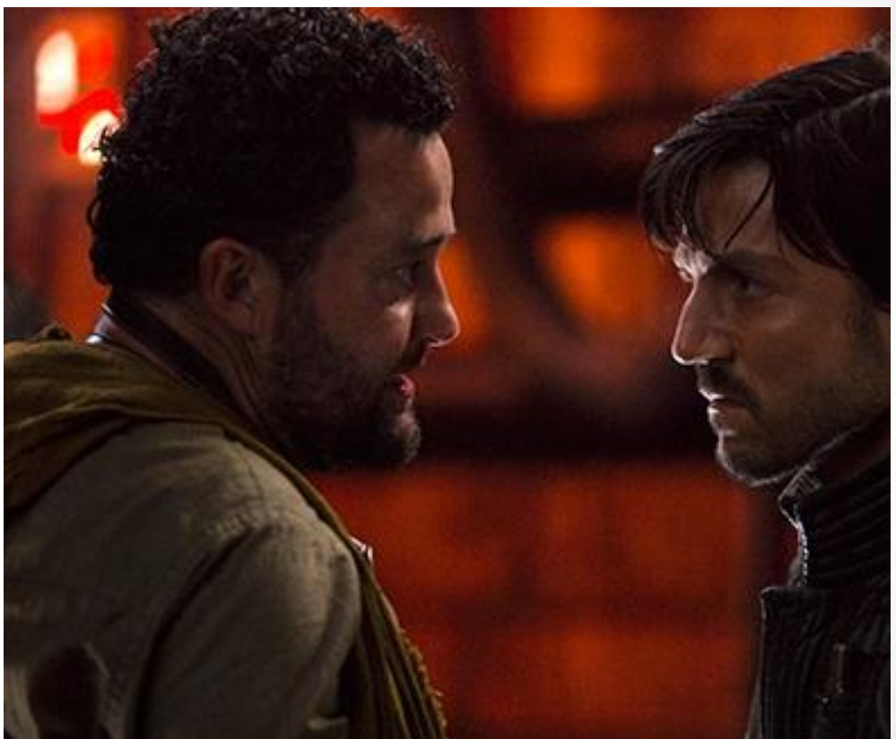
From "Star Wars Universe" by Unknown Author, n.d., retrieved from <a href="https://www.starwars-universe.com/personnage-3906-tivik.html">https://www.starwars-universe.com/personnage-3906-tivik.html</a>. CC BY-NC-ND.