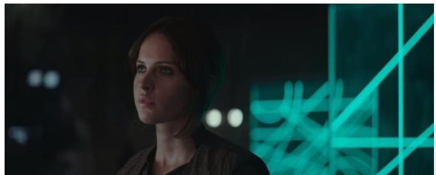
From "Star Wars Universe" by Unknown Author, n.d., retrieved from <a href="https://www.starwars-universe.com/personnage-4150-jyn-erso.html">https://www.starwars-universe.com/personnage-4150-jyn-erso.html</a>. CC BY-NC-ND.