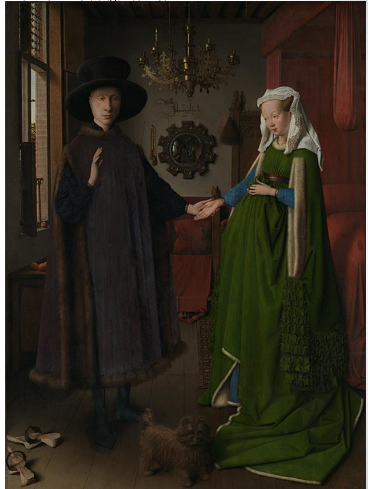
From The National Gallery, n.d., https://www.nationalgallery.org.uk/paintings/jan-van-eyck-the-arnolfini-portrait#