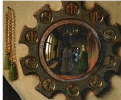
Figure 8 Detail of mirror