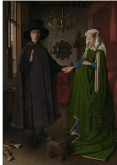
Figure 7 The Arnolfini Portrait, Jan Van Eyck