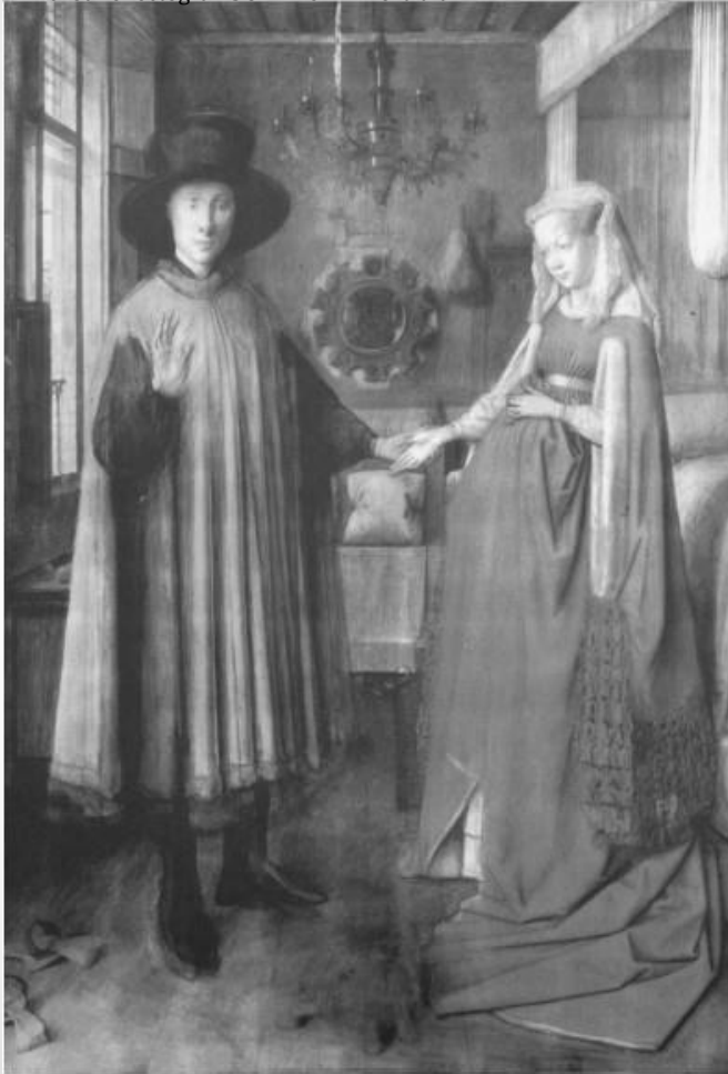
Figure 4 Infrared reflectograms of Arnolfini Portrait

From Billinge and Campbell, 1995, http://www.jstor.org/stable/42616093