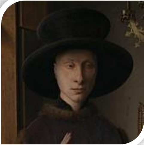
Figure 2a & 2b The Arnolfini Portrait, Jan Van Eyck