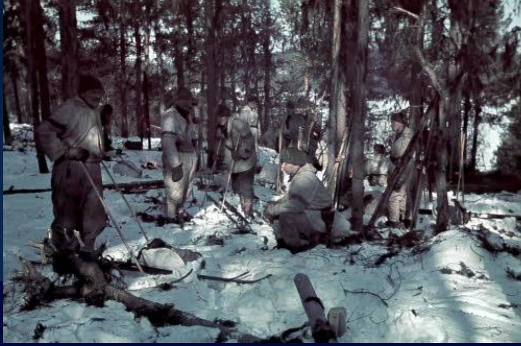
Figure 8-11. "The Continuation War."