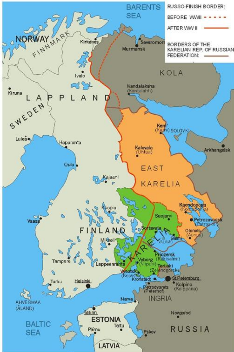
Figure 12. Andersen, Andrew. Finland after World War II. 2003. https://www.reddit.com/