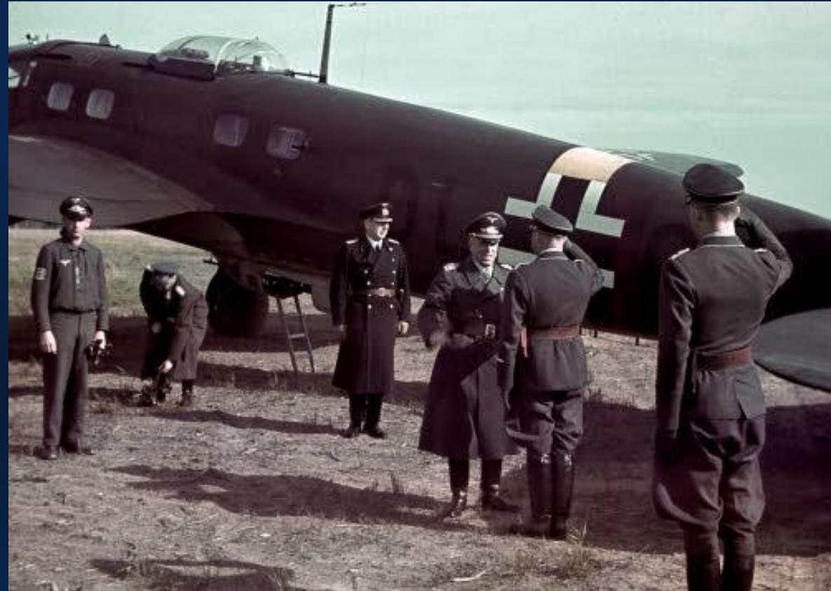
Figure 6 "The commander of Luftflotte 1, Colonel General Alfred Keller arrives at Mensuvaara airport to inspect the German gunboats."

May 25, 1941, meeting between Finnish Army General Staff and the Oberkommando der Wehrmacht (OKW)