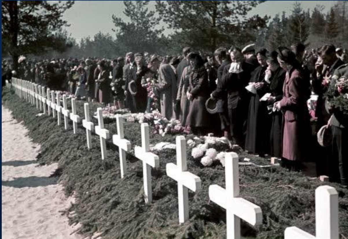
Figure 13 "Laying Wreaths at the Graves of the Fallen." The Finnish Home Front.

“If war and peace could be decided by the front-line soldier, wars would be few and far between, and peace would be just. He knows the horrors of war.”