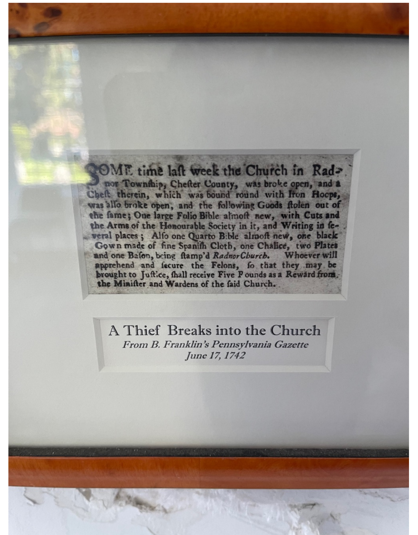
Figure 7. Interior of St. David's Church.

In my research, I discovered a possible error in the archives of St. David's. In the church is a newspaper article describing the theft of church items in 1742. While there existed records of theft of church items in the summer of 1742, these were instead listed in American Weekly Mercury article.