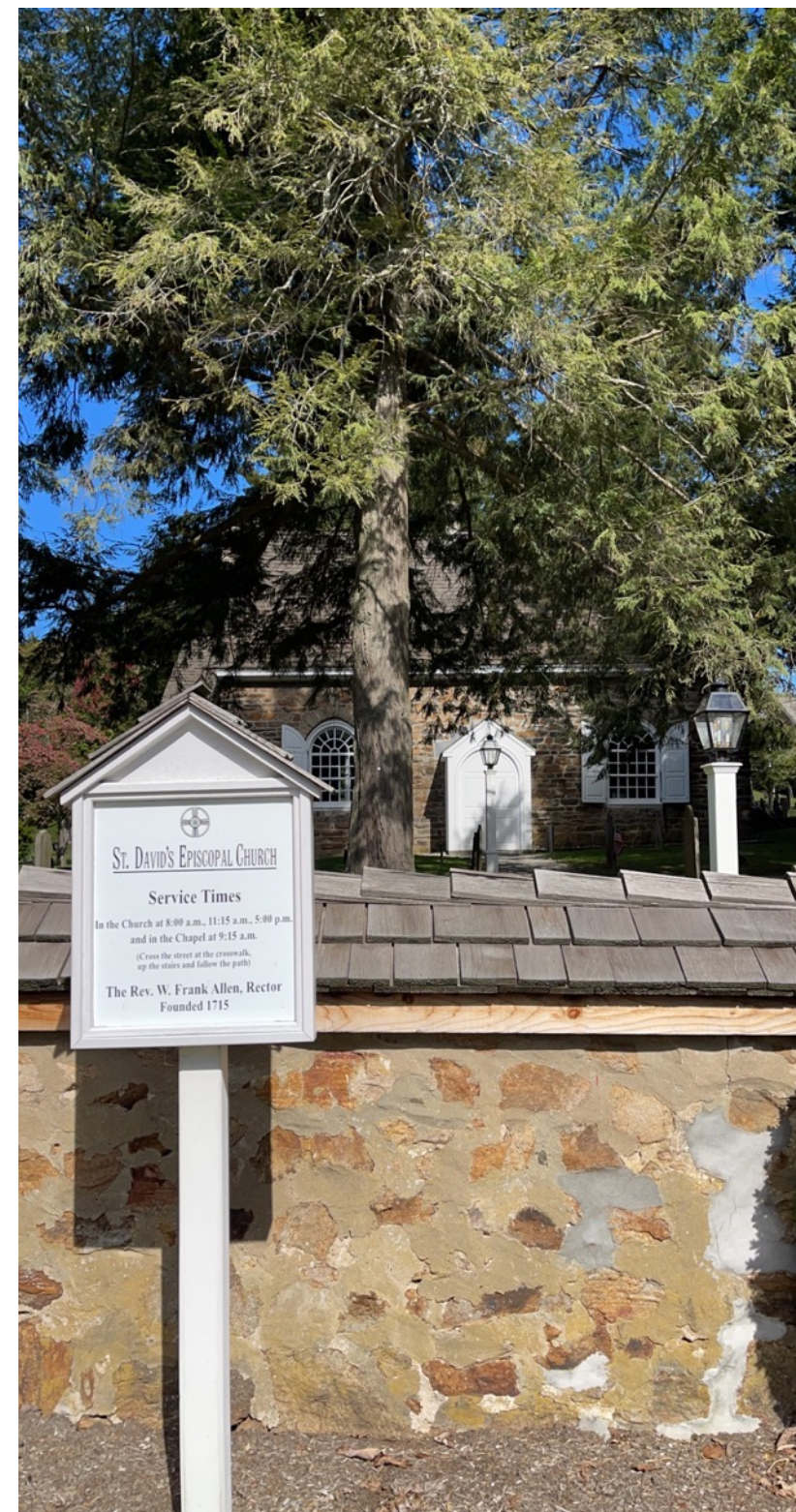
Figure 3. St. David's Church.

The graveyard at St. David's is the final resting place of several historical figures and many parishioners from the colonial era