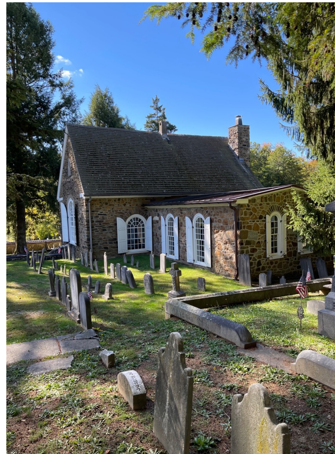
Figure 2. St. David's Church.

Living only a few miles from the church, I have personally visited the grounds and interviewed the parish priest and members of the community. In addition, using primary sources and archives at the church has contributed to my research.