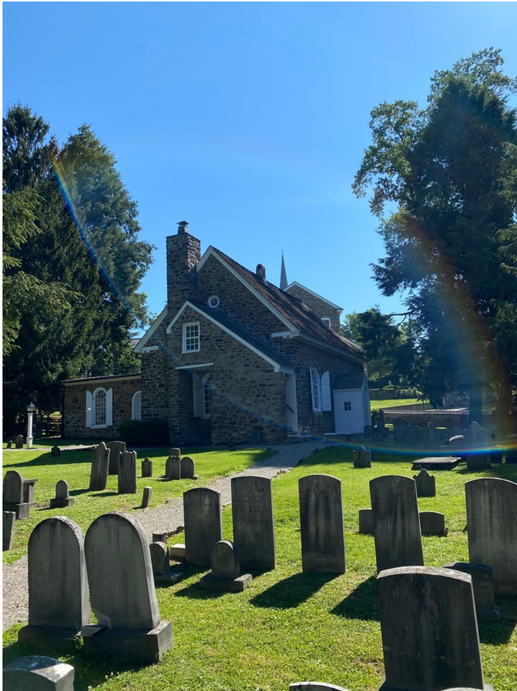
Figure 1. St. David's Church.

Living only a few miles from the church, I have personally visited the grounds and interviewed the parish priest and members of the community. In addition, using primary sources and archives at the church has contributed to my research.