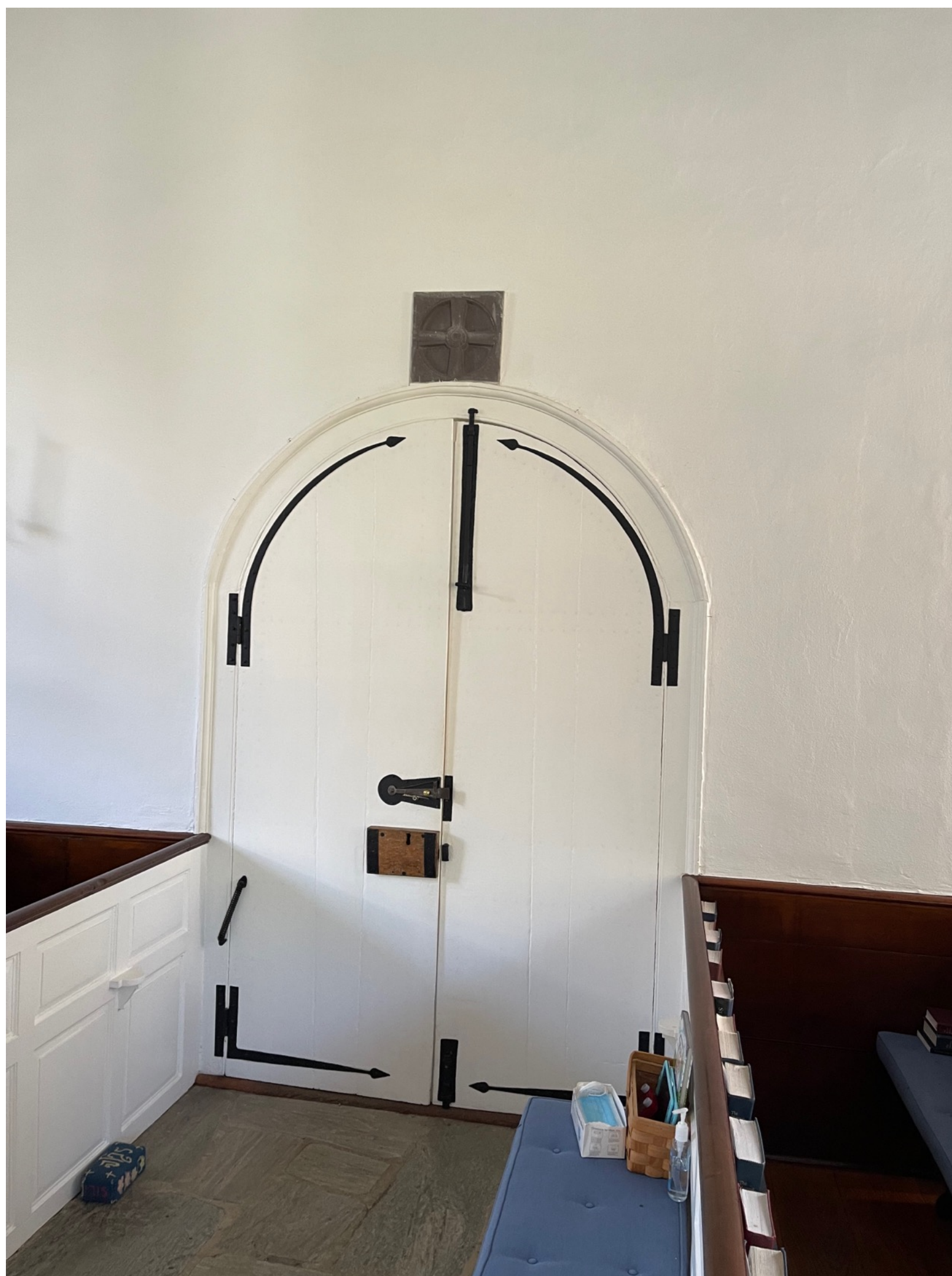
Figure 5. Interior of St. David's Church (Photo by Maximus Marlowe).

Above the door to the church contains a stone gifted to the parish in the late 18 th century. From St. David's cathedral in Dyfed, Wales, this stone carved into the shape of a cross is from the 9 th century and was included in the original construction of St. David's Cathedral in Wales