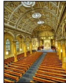
1918 St. Anne's Outside and Inside 1920 Downtown Berlin, NH Map and Photo