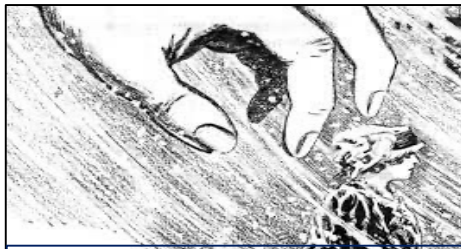
Influenza Epidemic of 1918 captures millions.