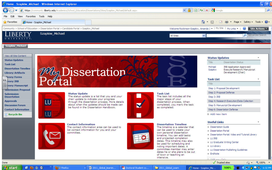
Figure 2. My Dissertation Portal.

In August 2010, prior to the beginning of the fall semester and integration of SharePoint, all candidates enrolled in the dissertation process received an e-mail from the researchers informing them about the study and requesting that they complete an online questionnaire located on a secure online survey system. One follow-up e-mail was sent. Entrance to a drawing for $10 gas gift cards was offered for completing the online survey. In February 2010, all participants received another e-mail from the researchers requesting that they complete another online questionnaire.