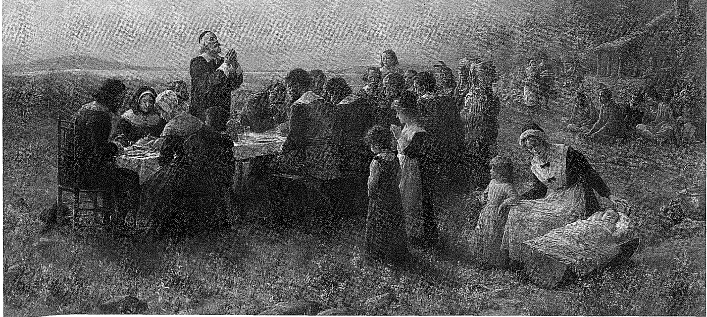
The First Thanksgiving by Jennie Brownscombe.