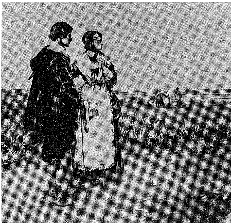
Engravings from The Mayflower Pilgrims by Edmund Janes Carpenter

ocean and sighted the shores of Cape Cod in the early morning of November 9, 1620.