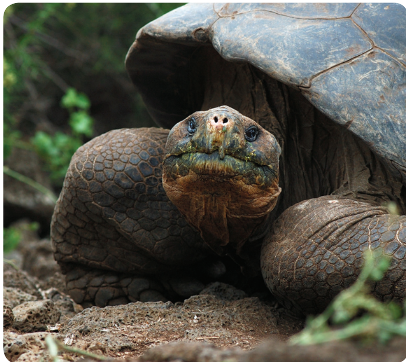
Giant Tortoise