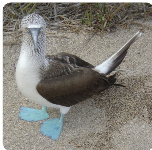
Bluefooted Booby