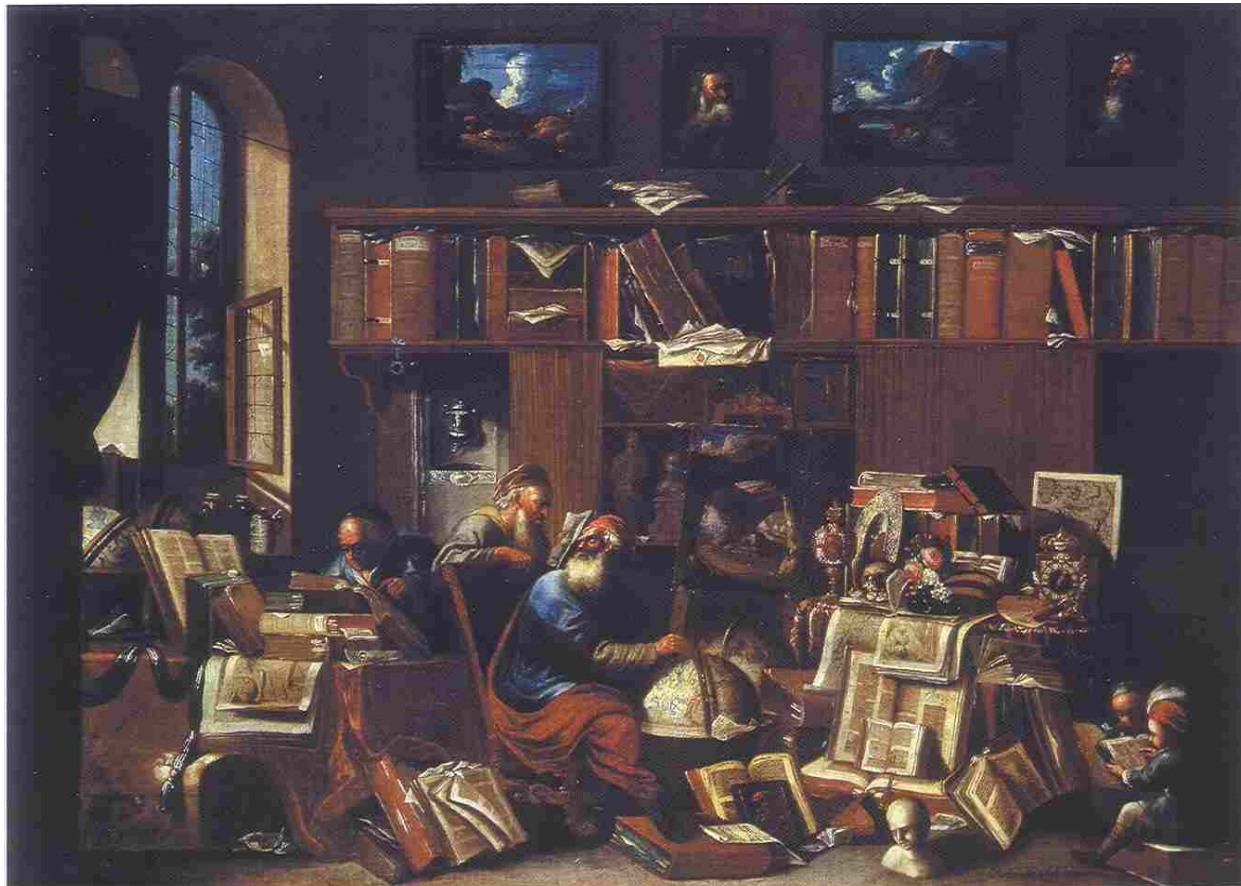
Philosophers in Study (1700) by Johann Michael Bretschneider

The Undergraduate Research Symposium is a forum where Liberty University undergraduate students can share the findings of their research papers and projects and receive valuable feedback from the academic community. The audience will consist of students, faculty, and the general public. Content may be presented as posters—print or digital—or presentations—individual or group.