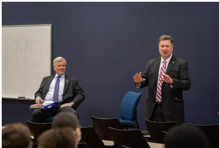
Governors Bob McDonnell (left) and Governor George Allen (right)

In addition, Former Virginia Governors George Allen and Governor Bob McDonnell visited the Helms School of Government for the Spring Public Policy Conference. The Governors participated in a legislative panel and spoke in various classes regarding politics and policy.