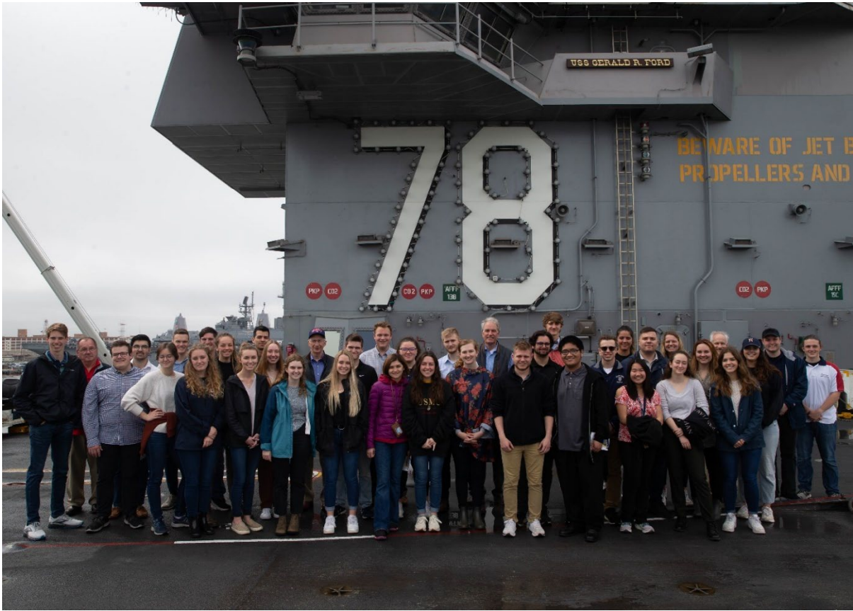
Faculty and Students aboard the USS Ford Flight Deck