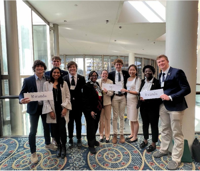
Liberty University Model UN Team

The Liberty United Nations Association participated in the Southern Regional Model United Nations (SRMUN) conference in Charlotte, North Carolina. Our students represented Israel and Rwanda among 30 other universities in negotiating issues such as the war in Ukraine, peace in Afghanistan, and climate change. Students of the Israel Delegation won the Best Delegate Honorable Delegation Awards, crediting their leadership in the negotiation process.