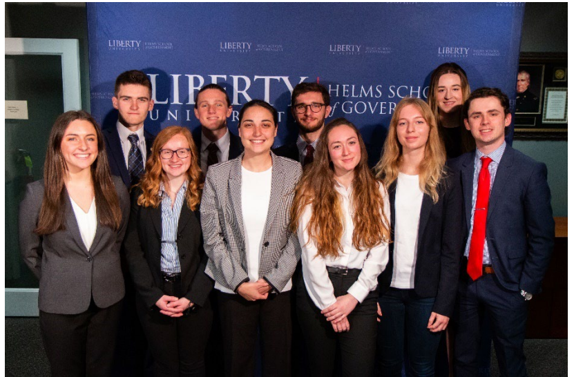
Students at the VSP Briefing