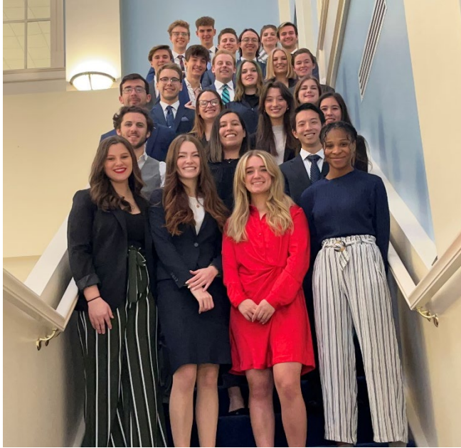
2022 Mock Trial Team