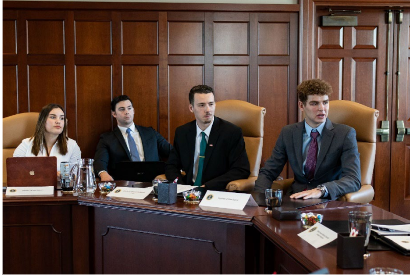
Students Participate in the White House Simulation