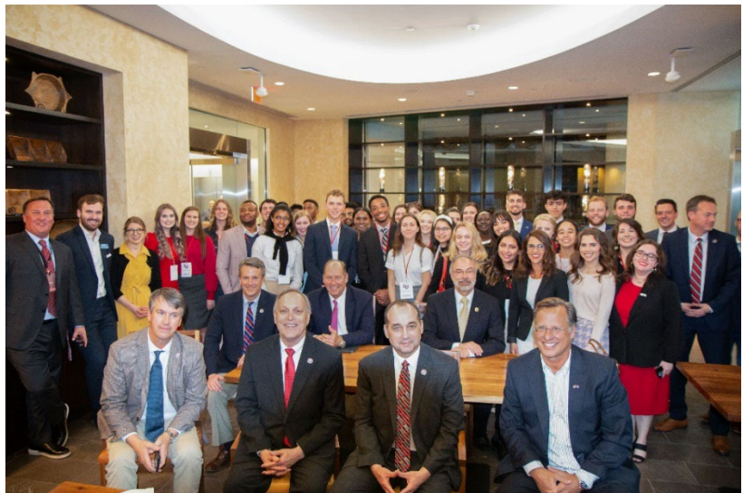
Students at Museum of the Bible

Earlier this week, Helms School of Government students traveled to Washington, D.C. to meet with several Members of Congress including our local Congressmen Ben Cline and Bob Good. Students had the opportunity to engage with these policymakers at a critical time in our nation's history. In addition, students also had the opportunity to tour the Museum of the Bible. We are grateful to Dean Dave Brat and all of the Members of Congress who took the time to visit with our students.