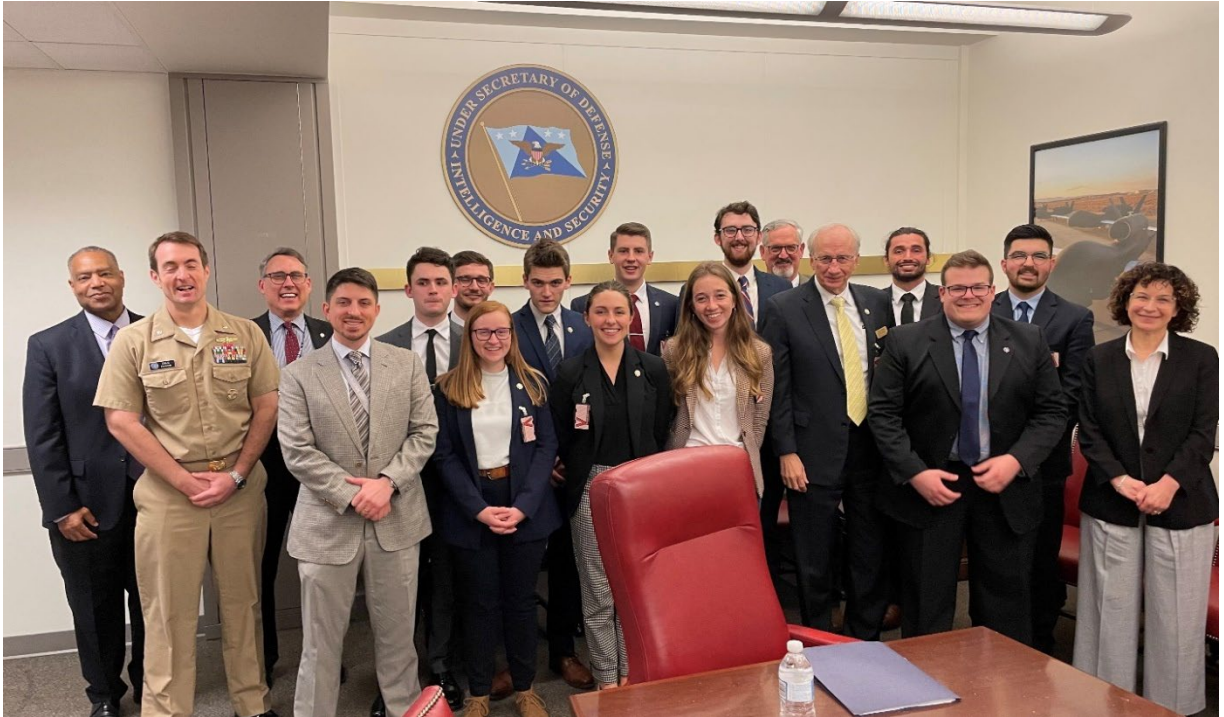
Students and Faculty meet with Senior Officials

The Liberty Analytic Support Initiative (LASI) team briefed key cybersecurity officials at the National Security Agency, as well as senior officials within the Office of the Undersecretary of Defense at the Pentagon. The student team shared a framework for conducting sentiment analysis for multimedia and discussed the national security implications of changing natural resource competition. Both the Pentagon and NSA participants emphasized the importance of the work done by the students and were eager to collaborate on the team's analytical findings. One senior Department of Defense official expressed his sincere appreciation for their complex analysis while noting its contribution to their deeper understanding of the problem set. He further voiced his confidence that these future national security professionals will be more than ready to take the baton from the current generation of leaders when the time comes.