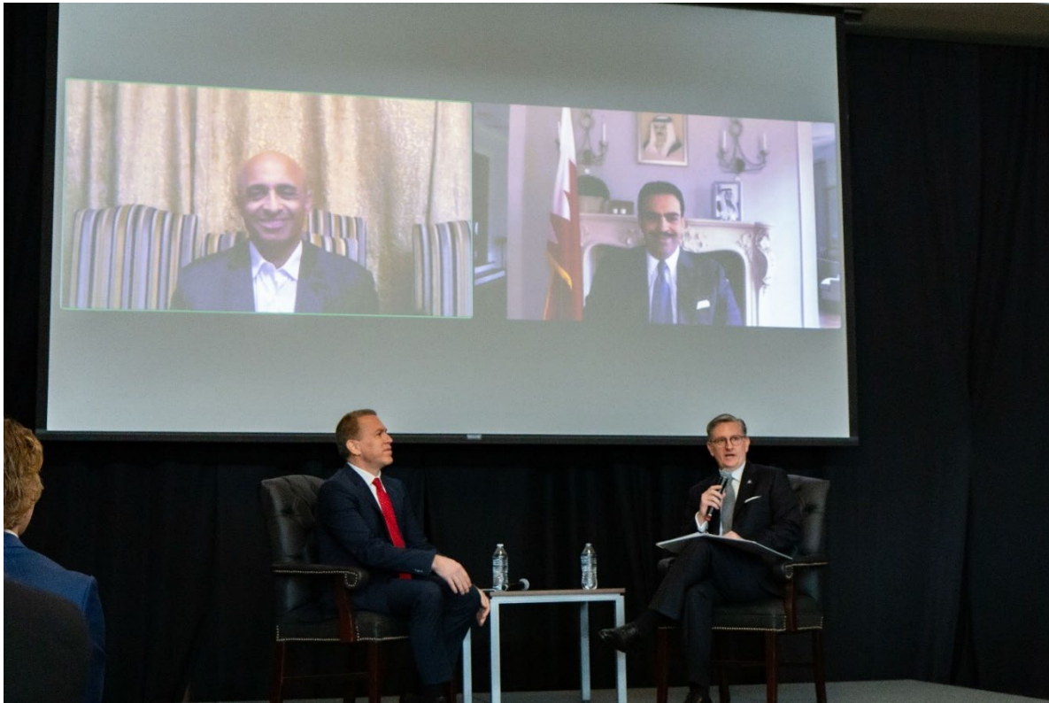
Abraham Peace Accords Ambassadors