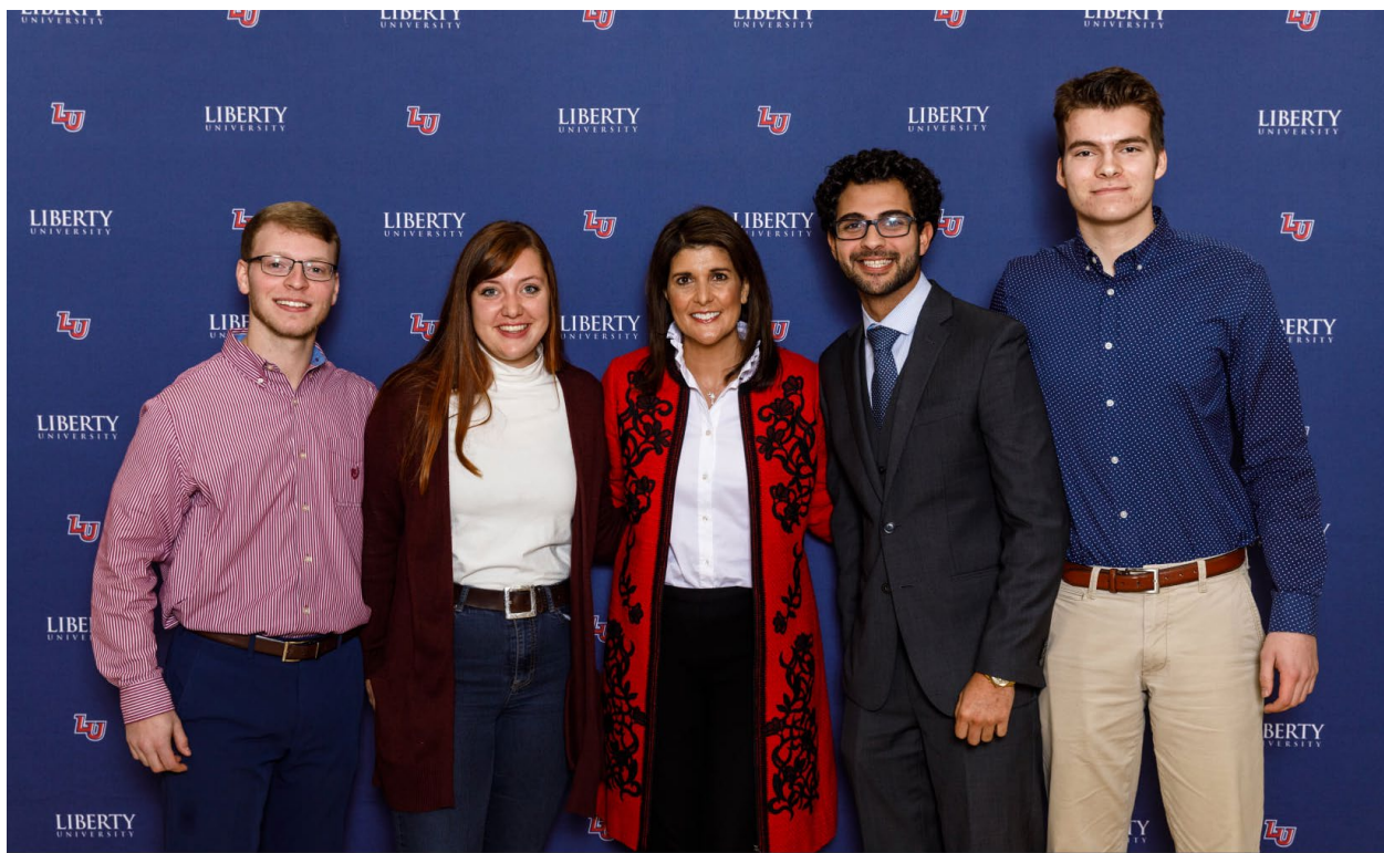
Former U.S. Ambassador to The United Nations, Nikki Haley With Alexander Hamilton Society Students

The Criminal Justice Club hosted their annual “Superhero Safety Day” where they partnered with the Virginia State Police to showcase services available to the community at large. Their guests were from the Virginia State Police, local police departments, and local fire departments.