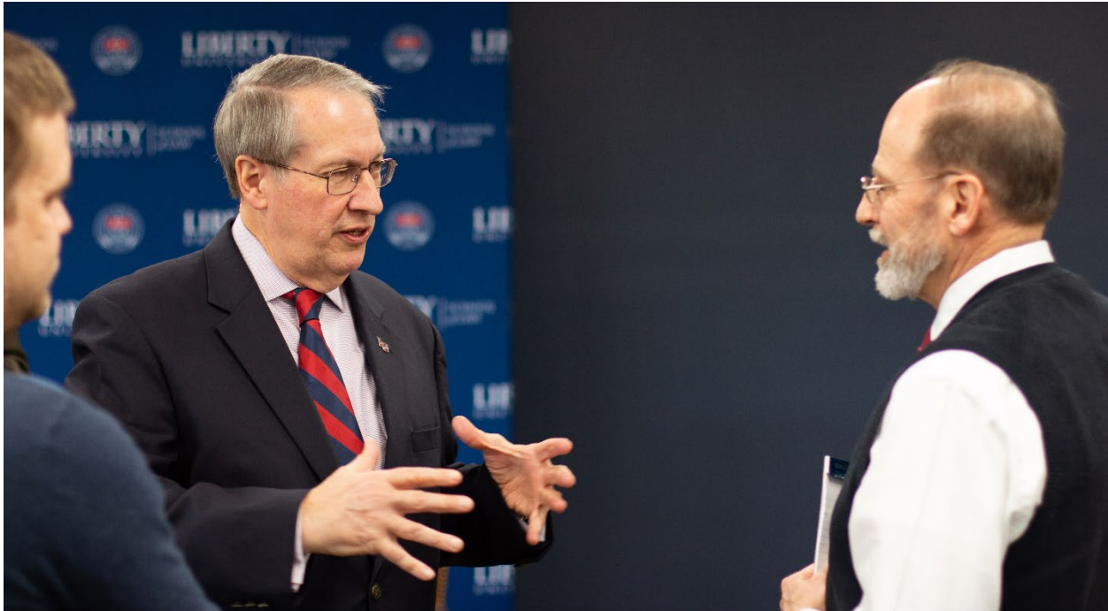
Former Congressman Bob Goodlatte visits and discusses presidential impeachment