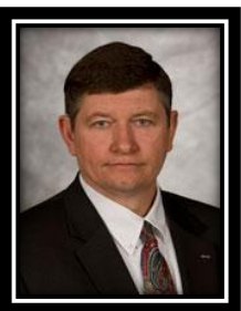
Robert Ritchie School of Arts and Sciences: History LUR: Undergraduate - $1,000