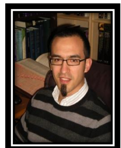
A. Nathan White School of Religion LUO: Undergraduate - $2,000