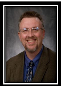
Sam C. Smith School of Arts and Sciences: History LUR: Graduate - $3,000