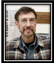
Edward A. Edman School of Communications: VCAR LUR: Undergraduate - $3,000