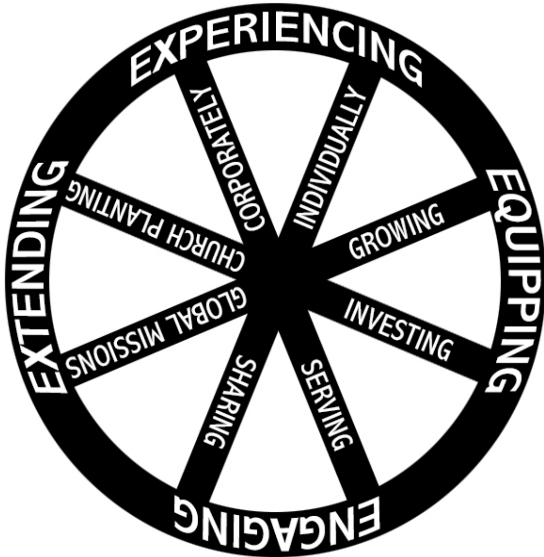
Figure 4. E-System Diagram 57

Jim Collins, in his book, Good to Great , shares what he calls the “flywheel” effect that his research team saw in great companies. He says to picture a 5,000 pound flywheel that is thirty feet in diameter and two feet thick and mounted on an axle. The goal is to get the flywheel