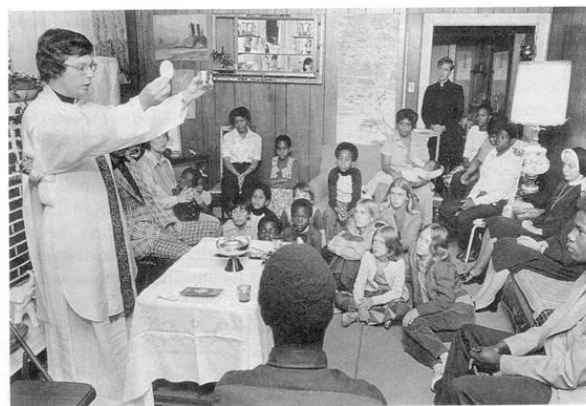
One of the major changes in the Roman Catholic Church after the Second Vatican Council was the willingness to bring "church" out into the daily lives of parishioners. Here mass is being celebrated at a private home in the inner city of West Philadelphia.

While there is no empirical data, liturgical house churches exist in almost every Apostolic form of Christianity in North America.