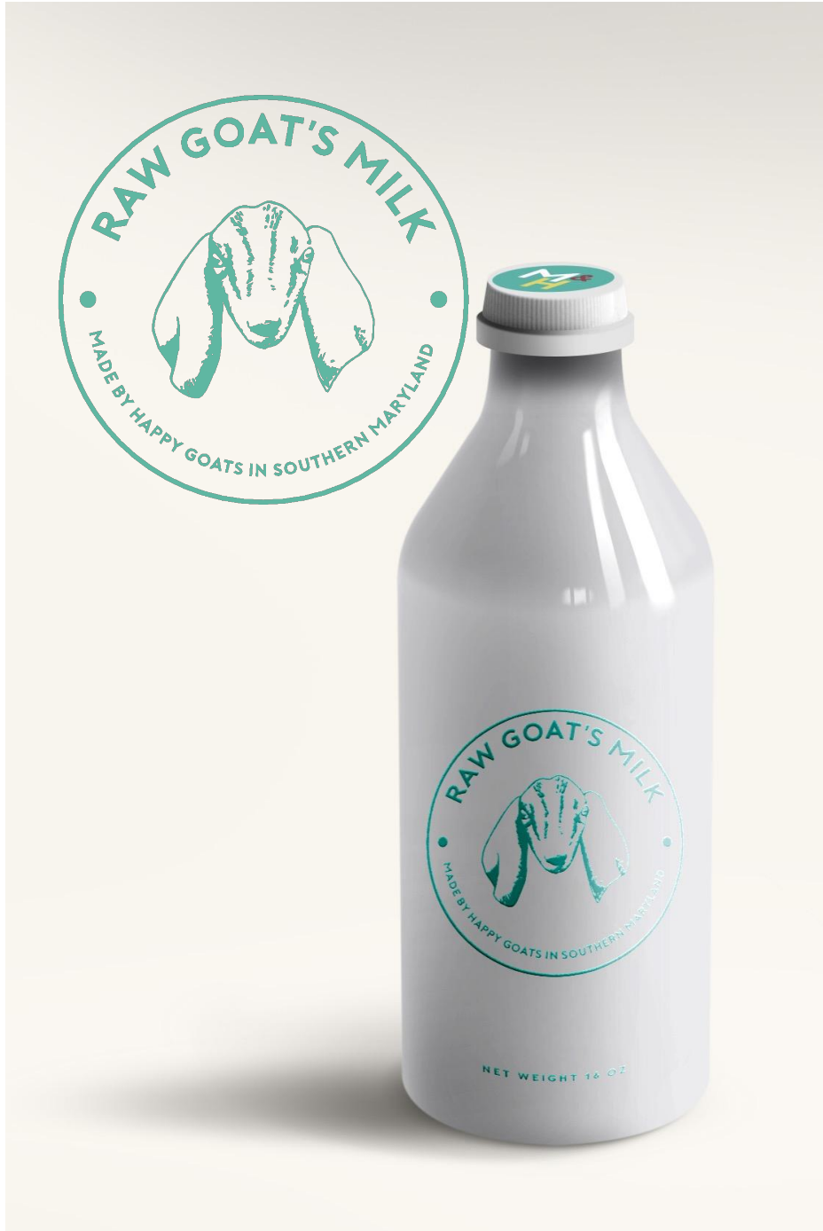
Mockup of reusable goat's milk jar