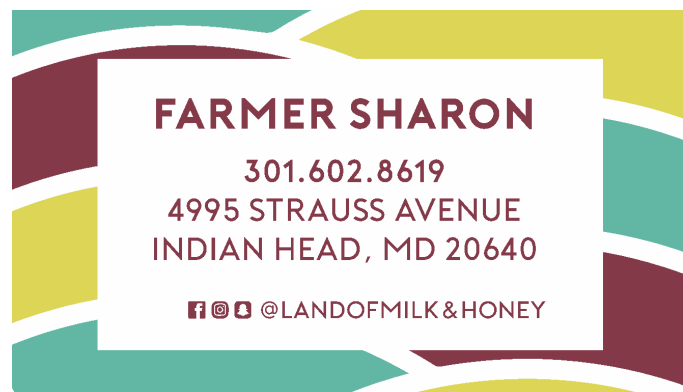
Business Card, front and back