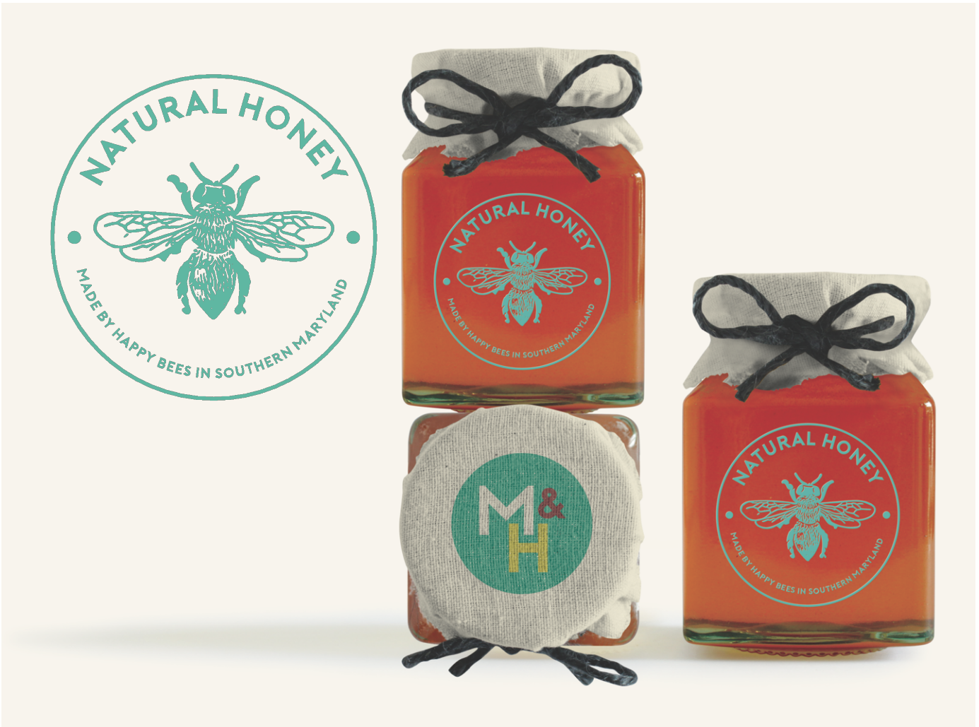
Mockup of reusable Honey Jars