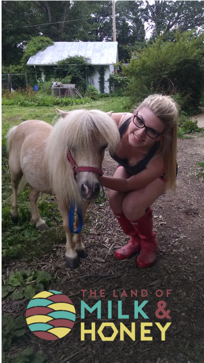
A Mockup of an actual Snapchat Filter, submitted online to Snapchat