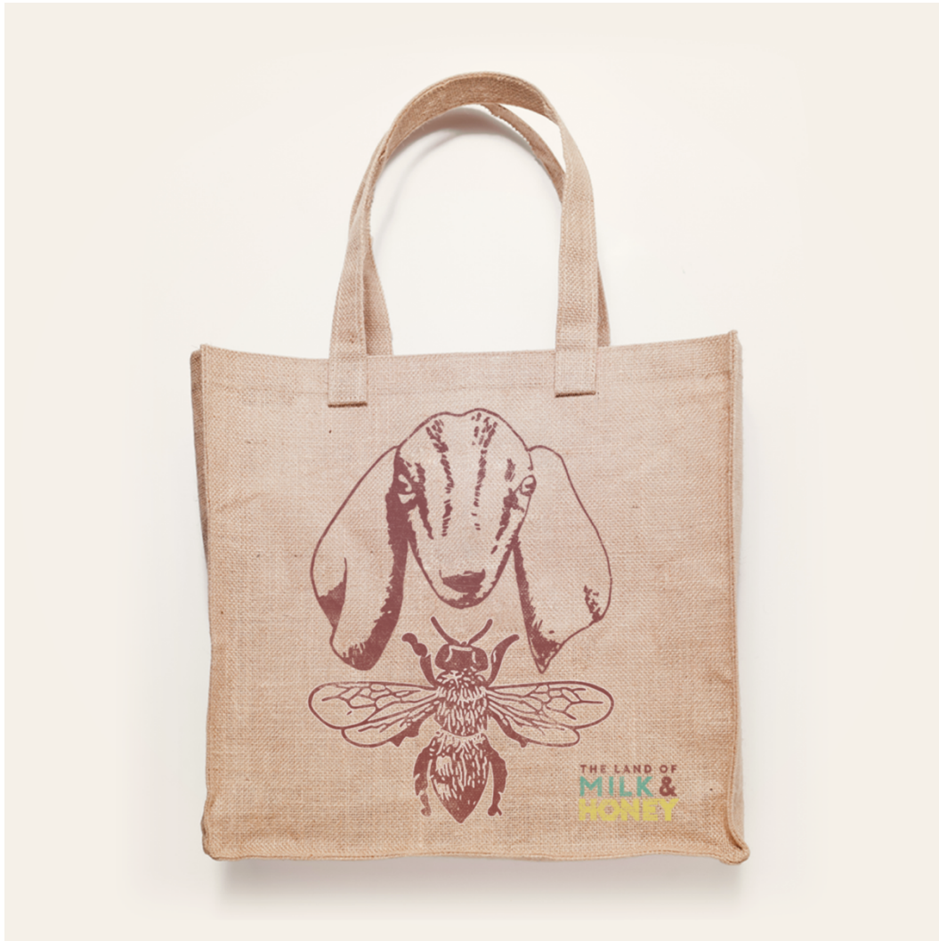
Mock-up of a reusable produce bag