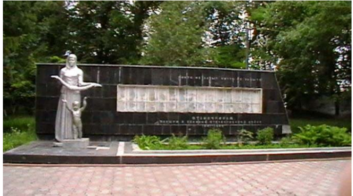
Monument honoring Arkhonskaya's Cossacks

The contemporary situation is very different. Under Russian defense regulations, Cossack organizations are not allowed to participate in military operations as discrete units. However, individual Cossacks who wish to be involved may contract with the Ministry of Defense and thus serve in a regular military organization while still being recognized as Cossacks. Through this arrangement, individual Cossacks from many North Caucasus communities, including Arkhonskaya, are perpetuating the Cossack tradition of service to the Russian state. 8