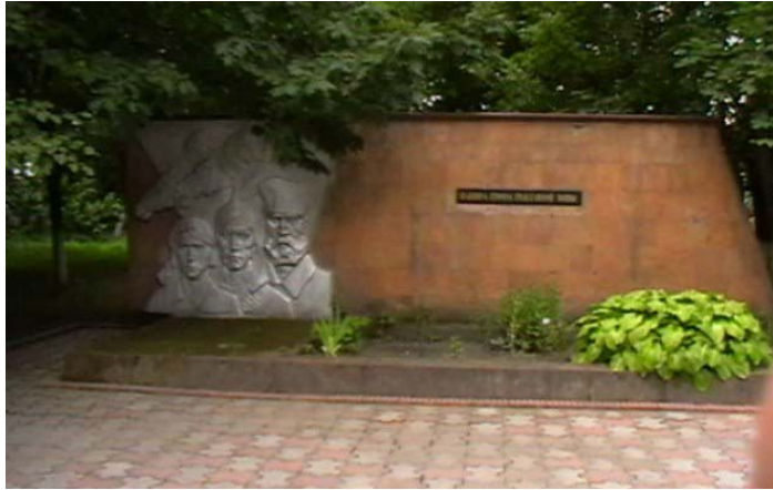
An Arkhonskaya memorial to cultural figures

While Cossack organizations have been known to discourage the excessive use