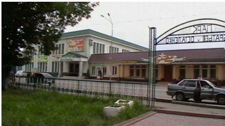
Arkhonskaya's main street is a reminder of the prosperity that makes this region attractive

While Arkhonskaya has not suffered from the violence associated with other