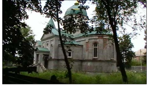
St. Alexander Nevsky Church

order to realize their dream of having a functional church. While the overwhelming majority of village residents are Orthodox Christians, there is also a small Muslim community. No other religious communities are represented in Arkhonskaya.