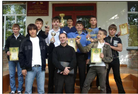
Participants display course certificates

to offer this instruction for Arkhonskaya's young boys. As the program draws to an end, participants receive the certificates ( pictured on the right ) which attest to their completion of the instructional program and their possession of skills which will help qualify them for Cossack membership in the future. Many of those completing the course become members of the Terek Cossacks.