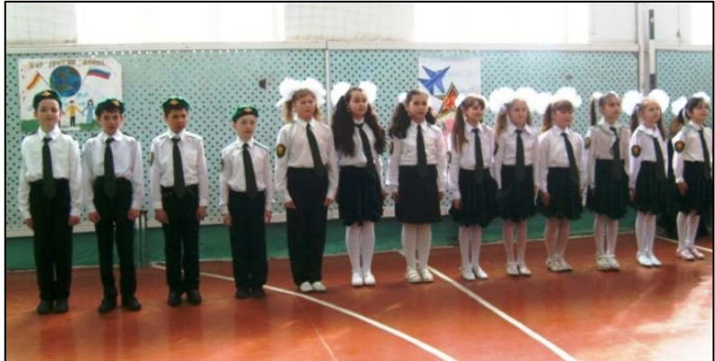
Children of School Number 2 in 2009

work outside the town. The most obvious appeal of a place like Vladikavkaz in contrast with Arkhonskaya is a higher salary for the same work. If a person enjoys the relatively modest cost of maintaining a home in Arkhonskaya, the generous urban salary makes possible a higher standard of living. Yet, as long as Arkhonskaya continues to offer opportunities for productive work, the attraction of a higher Vladikavkaz salary is limited. The benefit of that salary is reduced by the expense and inconvenience of a long commute. A worker could avoid the long commute by maintaining an apartment in Vladikavkaz but, again, that is an expense that must be counted against the urban salary. Equally compelling is the fact that the commuting worker would then miss the benefits of a more relaxed small town life by having a permanent residence in the city. Of course, as noted