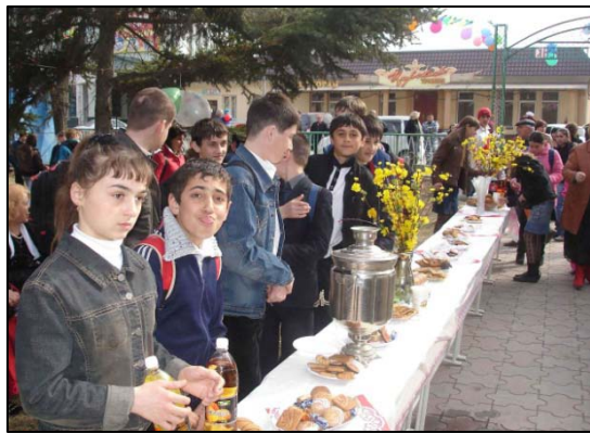
End of school year festival in 2009

Just as the opening of the Russian school year is an important event in the life of every town, the conclusion of the school year is also marked by special events. Each spring, students from all of Arkhonskaya's schools, their parents, and the teachers gather for a picnic in the village's culture park. The occasion is marked not only by an abundance of food but also by music and speeches which emphasize the important role played by Arkhonskaya's school in making it possible for young people to have the skills needed to be productive members of this community.