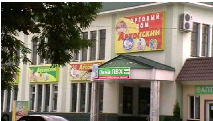
Arkhonskaya's house of business hosts several private commercial enterprises

Lawlessness is commonplace throughout much of the Caucasus and Arkhonskaya residents live in the shadow of violence. In a six month period, twenty-two North Ossetia residents (nineteen Ingush and three Chechens) disappeared. The mutilated body of one victim was found but the others remained missing and, over a year later, nobody had been detained or was even suspected of committing these crimes. In the nearby village of Chermen a group of unidentified men shot three local Ingush youths, all of whom died. 13 Trouble may well have been averted earlier when officers of the Russian Ministry of Interior seized 5 kilos of ammonite, two 200-gram TNT sticks, 147 detonators and a 180-metre length of igniting cord from a 43-year old man who lived in Arkhonskaya. 14