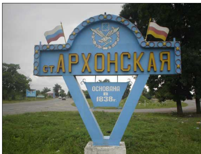
Sign at entrance to Arkhonskaya

Given the region's favorable climate and soil conditions, it is not surprising that most residents are employed in agriculture and that agriculture is the most important and profitable local industry. Yet, Arkhonskaya is more than a farm community and there are other occupations. For example, there are many people who benefit from Russia's economic reforms and have their own