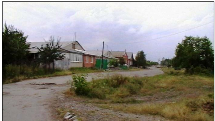
Unpaved, irregular streets are common in many Arkhonskaya residential areas

northern slopes of the Caucasus Mountains into Russia. The Prigorodny district, which has a population of just over 100,000), was once a part of Ingushetia and still has a significant Ingush minority. Arkhonskaya is identified as a stanitsa which implies that it is bigger than a "village" but smaller than a town or a city. Usually they are more urbanized in that they have greater commercial diversity. In