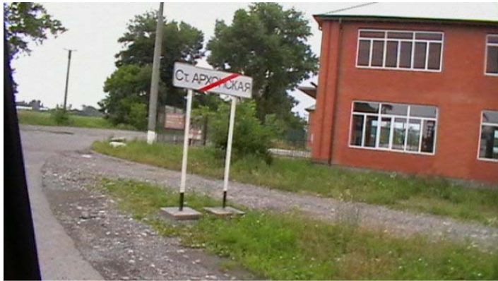
Sign seen upon leaving Arkhonskaya

The worldview of any community is a complex amalgam of many cultural elements. For Arkhonskaya, one of the most conspicuous values is the veneration of the traditions of the Terek Cossacks. Those traditions are memorialized in public displays which can be seen in Arkhonskaya's park as well as in the cemetery with its monuments which honor the Cossack dead. The Terek Cossack tradition is not limited to the frozen postures of statuary and other artistic still life. A living Terek Cossack tradition is instilled into the youth of Arkhonskaya through the local educational system and the special courses offered for young people who want to learn the skills needed for service with the Cossacks. Equally significant is the belief system of the Russian