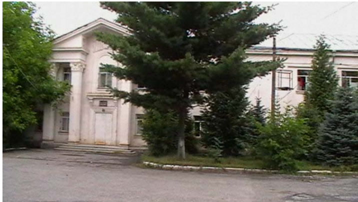
Arkhonskaya's Art Center is a focal point for cultural activities

While maintaining a tradition of service to the Russian state, the Cossacks of Arkhonskaya also serve the local community. There is a formal Cossack organization in Arkhonskaya which is supported by the village administration. In turn, the Cossacks help Arkhonskaya in several ways. First, they are