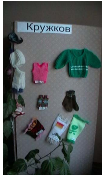
Handicraft produced in Arkhonskaya

Equally important as both a basic service and a support for maintaining the local population is the Arkhonskaya school system. There are two schools in the village and, as a result, children are able to complete their studies without having to travel to nearby towns. In these schools children are taught the basic subjects that one would expect for young Russians. In addition, the schools offer instruction in handicraft production. Given the fact that the handicraft industry is an important component of the North Caucasus community, this is an important contribution to maintenance of the local labor force. Formal instruction is supplemented by handicraft exhibitions which are organized by the schools and local competitions to cultivate the skills of Arkhonskaya's youth. The picture on the right shows an exhibition of knitted goods for small children. They are examples of locally produced items which are sold