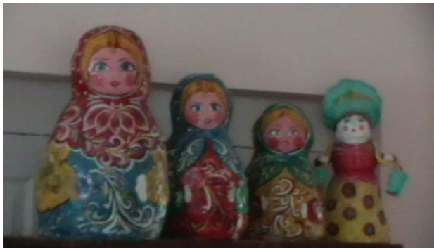
Locally produced nesting dolls

throughout the region. Another locally produced item, one that has long been synonymous with Russian culture, is the matryoshka or “nesting doll”. These dolls are typically made of wood from the linden tree, painted in accordance with the appropriate local artwork, and aged for two years to ensure durability. The ability of Arkhonskaya's youth to practice this art represents an important skill in