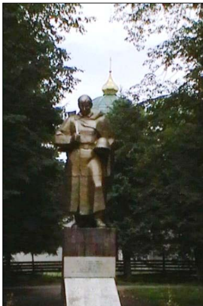
Statue in Arkhonskaya’s park honors Terek Cossacks who died in combat.

While there is more to Arkhonskaya today than what one might think of as a “Cossack community”, it is important to note that the establishment of Arkhonskaya was a consequence of the advance of Ukrainian Cossacks into Prigorodny. At the entrance to the village, a sign notes that Arkhonskyaya was founded in 1838. It was in this year that seventy-nine of the Ukrainian Cossacks, who were accompanied by their families,