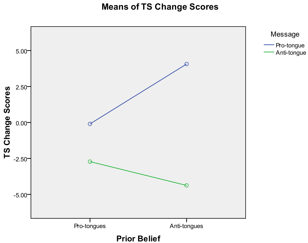
Figure 2. Mean TS change scores of pre-existing belief and cover page groups.