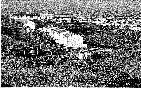
Government housing outside Johannesburg.

M any people have no idea what the word apartheid means, even though apartheid (racial separation) lies at the crux of the South African dispute. Confusion abounds. But this confusion does not negate the importance of the South African debate.