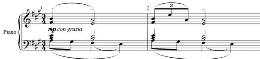
Example 16: Ireland’s Beckon to me to come , the ‘beckoning’ motif.

conclusion. Pilkington notes that this “beckoning” motif, which is used as a sort of ritornello, is that of a “fluttering handkerchief” 251 (Example 16).