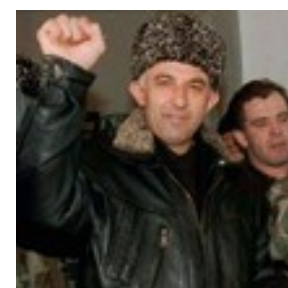
President Aslan Maskhadov