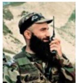
General Shamil Basaev