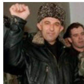
President Aslan Maskhadov