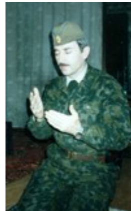
Former Chechen President Jhokhar Dudaev performing a religious ritual