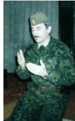
Former Chechen President Jhokhar Dudaev performing a religious ritual