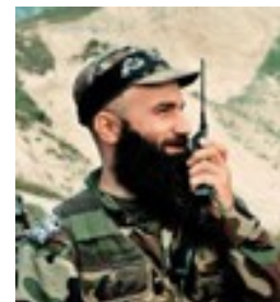
General Shamil Basaev