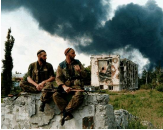
Chechen soldiers resting after combat