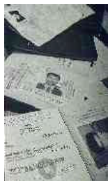
Fake IDs confiscated by police