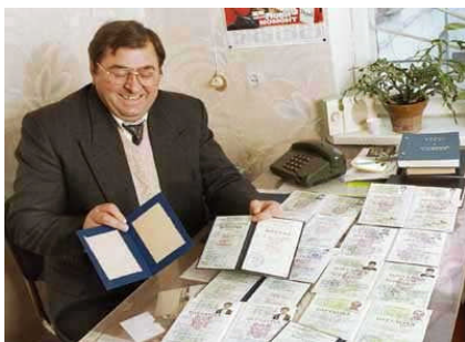
Fake graduation documents

A willing and available university is required for accomplishment of either of the above objectives. Many well-established universities have been mentioned in this connection. Widespread international attention was focused on Moldova’s Free Independent University of Moldova after Romania’s prominent Ecological University, one of the several independent universities to appear in the wake of the collapse of the communist regime in 1989, was implicated in the sale of advanced degrees in dentistry. ULIM’s activities first came to the attention of the Romanian National Council for Academic Evaluation and Accreditation when it was accused of granting doctoral degrees without state authorization 15 . As the National Council investigated the activities of the Ecological University it charged that ULIM was also issuing doctoral degrees in return for participation in a four-week “training program” and payment of a generous amount of money. 16 Most widely commented upon was ULIM’s doctorate in economics, a document that, according to Romanian investigators, was being utilized by many individuals hoping to either advance themselves professionally or to establish new identities. 17