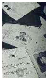
Fake IDs confiscated by police