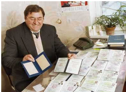
Fake graduation documents

A willing and available university is required for accomplishment of either of the above objectives. Many well-established universities have been mentioned in this connection. Widespread international attention was focused on Moldova’s Free Independent University of Moldova after Romania’s prominent Ecological University, one of the several independent universities to appear in the wake of the collapse of the communist regime in 1989, was implicated in the sale of advanced degrees in dentistry. ULIM’s activities first came to the attention of the Romanian National Council for Academic Evaluation and Accreditation when it was accused of granting doctoral degrees without state authorization 15 . As the National Council investigated the activities of the Ecological University it charged that ULIM was also issuing doctoral degrees in return for participation in a four-week “training program” and payment of a generous amount of money. 16 Most widely commented upon was ULIM’s doctorate in economics, a document that, according to Romanian investigators, was being utilized by many individuals hoping to either advance themselves professionally or to establish new identities. 17