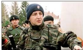
Zeljko Raznatovic (aka "Arkan") claimed he was member of Yugoslavian "National Guard." He was killed January 15, 2000.

Serbia itself has become a haven of international criminal activity. Serbian criminal groups operating abroad help fund militia groups in the Balkans. Zeljko Raznatovic ("Arkan the Cat") recruited his ethnic cleansers from a network of criminals. Arkan robbed banks and jewelry stores in Western Europe before leading his ruthless paramilitaries in the Croatian and Bosnian wars in the early 1990's.