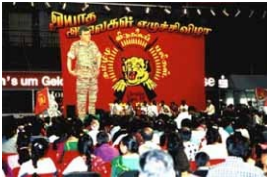
Tamil Elephant Pass Victory and Rising Day ("Eluchi Vizha") in Germany, June 17-18, 2000

Some terrorist groups, such as the FARC and ELN in Colombia, are self-sustaining, thanks to their lucrative criminal dealings. Most other terrorist groups depend on external support to maintain their operations. State-sponsored assistance may include material support through weapons and ammunition or political and ideological assistance.