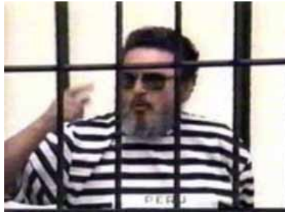
Abimael Guzman Reynoso lecturing the press after his capture.

In Europe, the 1999 capture of PKK leader Abdullah Ocalan dealt a serious blow to his organization. For the most part, his supporters have been reduced to protesting his incarceration and granting his release. Also in 1999, the capture of group leader Ta Mok helped doom the Khmer Rouge as a viable terrorist insurgency in Asia.