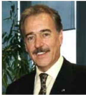
Andrés Pastrana Arango, President of Colombia

Foreign governments will often minimize evidence of criminal activity when negotiating with terrorist insurgencies. Shortly after his election, Colombian President Andres Pastrana Arango launched peace talks with both FARC and the ELN for the first time in eight years. President Pastrana has claimed that the FARC's involvement in narcotics is limited, despite ample evidence to the contrary.