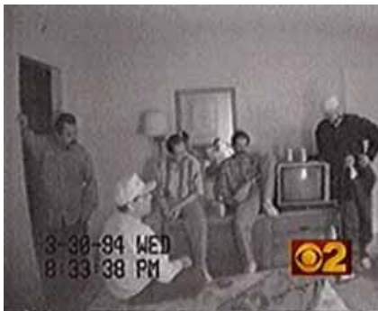
Federal prosecutors tape Mexican Mafia operating in Los Angeles, September 1997.

It is not surprising that the activities of criminal organizations are often mistaken for those of terrorist groups. Initial and hasty news reports contribute to widespread confusion about violent incidents. For example, the 2005 gas attacks on four "Maksidom" stores in St. Petersburg, Russia were immediately described as a terrorist attack. The simultaneous incidents involved the use of devices associated with terrorist groups and the planning resembled that of Islamic fundamentalist attacks in London earlier that year. Subsequent investigations, however, revealed this large Russian home improvements chain had been threatened by commercial rivals who proclaimed their intention to ruin the store's Christmas sales. Authorities found no links with terrorist attacks associated with Islamic groups in Russia's North Caucasus region. 1