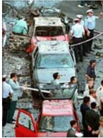
ETA Basque separatist July 29, 1995 bombing

Most terrorist groups seek to overthrow states. Some pro-state groups, however, seek to defend the existing political order. That difference has fueled fighting between terrorist groups with opposing ideologies, as has occurred in Northern Ireland, with Loyalist terrorist groups combating their Republican counterparts. This dynamic is also evident in Colombia, with paramilitary extremist groups such as the AUC fighting the FARC.