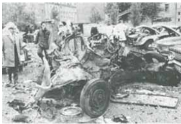
May 12, 1972 Baader-Meinhof bombing outside the federal police Munich Office.

Since 2001, our attention has been focused on International terrorism. However, both international terrorism and organized crime pose serious and evolving challenges to U.S. national security interests. Terrorist-criminal links are evident in virtually every region of the world. Some terrorist and criminal groups have coordinated for mutual gain, exchanging protection for money, as well as other mutually beneficial transactions. Though there is certainly potential for greater cooperation along the criminal-terrorist axis, there are also constraints that will limit such coordination. After all, terrorist and criminal groups are driven by different motives and sustained coordination requires a high degree of operational security.