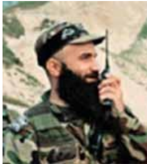
Jordanian-born Gen. Shamil Basayev insists he did not bomb Moscow in 1999.