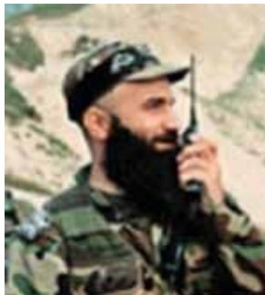
Jordanian-born Gen. Shamil Basayev insists he did not bomb Moscow in 1999.

Rebel leaders like Shamil Basayev, Ameer Khattab (aka Habib Abdul Rahman), and Abu Daba should not be dismissed or underestimated as mere warlords; they have sustained sophisticated political-military campaigns against Russian authorities, requiring complex financial, logistical, and combat operations. They also have mobilized Wahhabi extremists and Afghani mercenaries to further their own objectives.