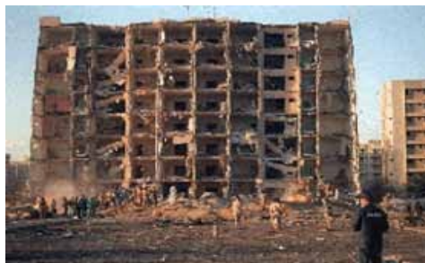
Building 131 at Khobar Towers, Dhahran, Saudi Arabia, after the June 25, 1996 terrorist bombing.

Terrorism has been a focal point of research and analysis since the 1970s, when terrorist hijackings and kidnappings attracted international press coverage. International criminal organizations have garnered more recent attention, most of it since the Cold War ended. Most studies tend to treat the two phenomena independently, or to lump them together under the rubric of "narcoterrorism." This analysis will examine and compare terrorism and criminal groups with respect to their motivations (and in particular those in Latin America and the former Soviet Union), organization, and modus operandi.