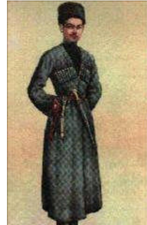
Traditional male attire

Yet, while many among the local accepted the idea of Islam as a political alternative, there was no popular rush to embrace the tenets of Islam as a guide for the daily lives of the Adygh people. The absence of a social revolution to match the Islamic-led struggle against Czarist rule was apparently a function of the fact that so many of Adegea's dogmas were already corresponded to those of the Islamic faith. The Islamic social demands, therefore, were nothing new and required no transformation in the lives of the Adygh people.