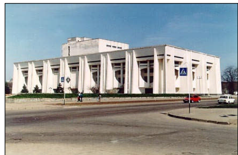
The main theater in Maykop is a center for the cultivation of Adygh culture and traditions.

About 3.5 million people of Adygh origin live in forty-five countries around the world. In Turkey there are approximately 3 million; in Syria there are 120,000; in Jordan there are 80,000; Egypt has a community of 52,000 while Germany had 35,000 and the United States has 20,000. Most of the Adygh people in these countries form ethnic communities which in their own Adygh language are called «Adygh Hasay». In Turkey the number of such communities is more than 100; in Syria there are six of them; in Jordan there are four; in Germany there are another four while Israel has two and the Netherlands has one. There are two in the United States. In Turkey, Jordan and Syria many Cherkessians occupy important state and social positions and influence the process of making decisions in political, economic and military spheres. Some members of the Cherkessian Diaspora are active in charity and have formed several socio-political organizations dealing with the repatriation of the Adygh people to their historical homeland. Many of the repatriated members of the Adygh Diaspora occupy important positions in religious organizations of the republic.