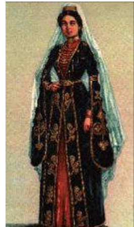
Traditional Circassian clothing

The first stage began in the seventh century with its penetration of the North Caucasus and lasted until the formation of the Crimean Khanate and expansion of the Turkish Empire into the territories on the Black Sea shore. During this period Islamic influence on the Adygh population was very insignificant and, for the most part, the Adygh people were pagans. But when Islam became the official religion of the Golden Horde, local Islamic influence became stronger as the Adygh tribes were subjugated to the Golden Horde. At that time Circassia had no contacts with powerful Islamic states and most of its interactions were limited to the Byzantine Empire and other Christian states. Consequently, during that period both paganism and Christianity were much stronger than Islam.