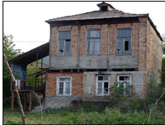
An abandoned house in Anaga