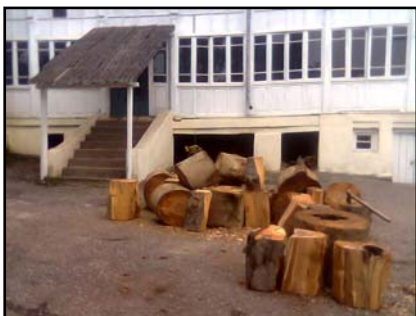
Wood used for heating the nursery building

Early childhood education in Anaga is conducted in two nursery schools, both of which face the challenges in terms of building maintenance, heating, and insuring that there is an adequately trained staff. As a result of educational reforms undertaken through the Georgian Ministry of Education, there has been a consistent improvement of standards in recent years for Anaga's nursery schools and its village school.