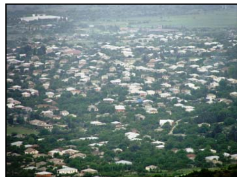
An overview of Anaga

The collapse of the USSR in 1991 left many unresolved questions about the precise location of Georgian borders, a situation which created a problem regarding Georgia's relationship with neighboring Azerbaijan. In 2006, a dispute arose over ownership of Kakheti's medieval David-Gareja monastery complex whose construction dates back to the 6 th century. Under Soviet borders, the complex was divided between Georgia and Azerbaijan, a fact that assumed great and disruptive significance with the collapse of the USSR. The location has historic as well as strategic significance for both Azerbaijan and Georgia so when a Georgian opposition parliamentarian claimed that Azerbaijan had moved its