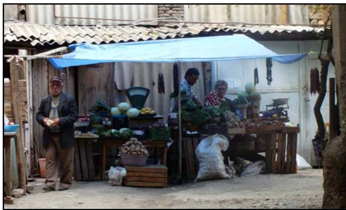
Anaga's open air market

When the season permits and consumer needs are more demanding, there is an alternative to Anaga's half dozen community shops. This is the open air market situated near the center of the village. From day to day, it varies in size depending on which entrepreneur has something to sell. And the products being offered will also vary on the basis of what items have been brought into Anaga either from nearby communities or from the city. For the most part, this market is an outlet for larger quantities of agricultural commodities and represents an important opportunity for