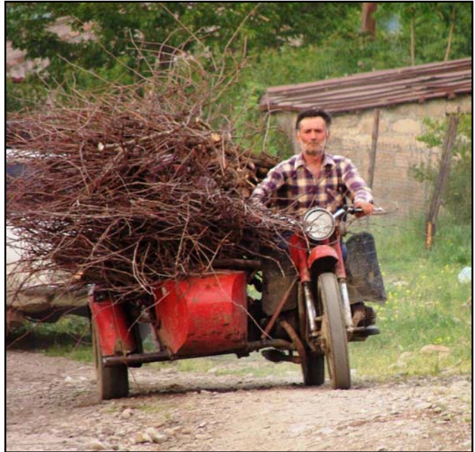
Anaga's residents have developed innovative approaches to overcoming transportation problems

The villagers are aware of politics but political topics are rarely a public passion in Anaga. They know that Georgia is involved in serious disputes with neighboring Russia, but this is not something that they discuss often or with great fervor. In the same way, they know that Georgia's leadership is seeking membership in the North Atlantic Treaty Organization. Generally, Anaga's residents support NATO membership, not because they see it as protection from Russia, but because they feel their membership in NATO would promote Georgia's economic development. The village's