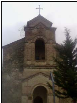
Anaga's ancient church

While the Christian spiritual life of Anaga has been revived it must be acknowledged that the architectural splendor of Christianity in this community has yet to be restored. One of the first things a visitor to Anaga will notice is the imposing edifice that once served the spiritual needs of these people. Now in ruins, this building is several centuries old and reflects the commanding presence of Christian Orthodoxy throughout this part of the Caucasus. Although no longer in use, even during