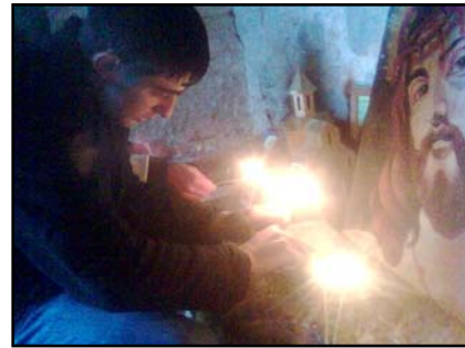
A worshiper lights a candle in the village church.

Anaga is a small community, home to only five hundred and sixty families. Anaga's residents are Christians who worship on a regular basis in the functional church hall which was erected in recent years. In spite of the suppression of religion during the Soviet era, the community retained its Christian faith even though its practice was seldom a public affair. With the collapse of the communist system, religious devotion is no longer hidden and a Christian heritage is widely recognized as part of the culture of both Anaga and Kakheti. In fact, in Georgia today the Christian Orthodox Church is consistently cited as the most respected of all national institutions.