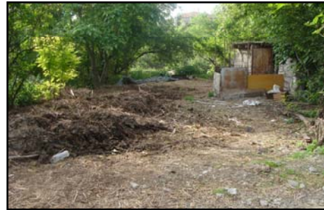
A well-maintained pig pen

In recent years there has been a considerable amount of attention on the prospects for development of pork production in the former Soviet Union. Multinationals such as Smithfield Foods have encouraged speculation about investment in the region. 7 The farmers of Kakheti are not affected by such discussions. For Anaga, pork production is a matter of economic survival, nutritional necessity, and tradition. It has nothing to do with global markets and has more in common with the private initiatives that flourished along side the Soviet Union's collectivized agricultural system. In Anaga each family does what is necessary to provide food for their pigs and maintain a suitable pen for containing their livestock. There are no religious prohibitions against the consumption of pork and most meals involve the use of at least one or two pig products.