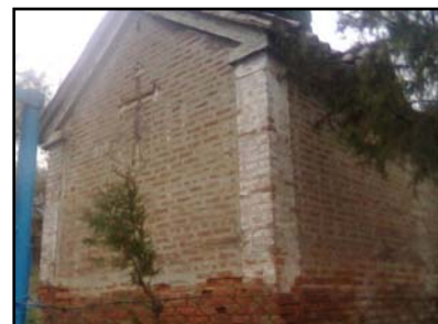
Anaga's church is a reminder of the Kartl-Kakheti Kingdom

Just over ten miles from Anaga is the town of Signagi, one of Kakheti's most popular tourist attractions and a tribute to the ingenuity of the industrious people of this region. This small town, with a population of just over 2,000, has been the beneficiary of a major renovation in which all the storefronts have been repainted and the town's once dirt roads have been paved in cobblestone in order to facilitate a look of charm and antiquity.