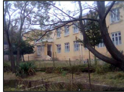
Anaga village school

the village's main institutions. The most prominent of those institutions is the village school. Maintaining and heating the building is one of the most daunting tasks with regard to the village school. There is a small teaching staff which must meet the needs of both the youngest and oldest of the children. For those who wish to go beyond this level, it is necessary to plan on a move to Tbilisi. This means finding a home in what has become a fairly expensive city and, for this reason, many of the children have limited educational prospects after high school.