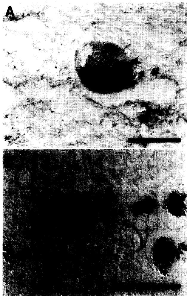
Fig. 1. Chondroitin sulfate immunoreactivity in Lewy bodies of Parkinson's disease. Substantia nigra neuron containing multiple Lewy bodies positive for (C-4S; panel A, arrowheads). Note typical rim-like staining. Lewy bodies were also seen with a homogeneous, pale staining (C-6S; panel B, arrowhead). Bar = 25 \mu m.

demonstrate CSPG in a variety of inclusions and reacting astrocytes associated with neurodegenerative diseases. Our study suggests that the inclusion-related cytoskeletal changes may be part of a larger program of structural reorganization which includes proteoglycans.