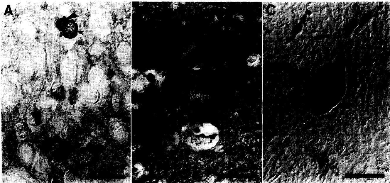
Fig. 2. Pick bodies usually showed weak immunoreactivity for chondroitin (arrowheads), however, the cytoplasm surrounding the Pick body was more intensely stained (C-4S; panel A, small arrowheads). Chondroitin immunoreactivity in diffuse Lewy bodies had a reticular staining pattern (C-4S; panel B, arrowhead). NFTs in progressive supranuclear palsy showed chondroitin immunoreactivity associated with fibrils within the cytoplasm (C-6S; panel C, arrowhead). Bar = 25 \mu m.

Extracellular proteoglycans have been shown to play roles in cell proliferation, migration, and cell adhesion. HSPGs and CSPGs are found primarily in the extracel-