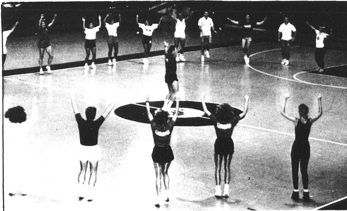
MOVE IT, MOVE IT, MOVE IT —Die-hard aerobic fans exercise to the beat during Lynchburg's Largest Aerobics Class Saturday morning in the Multi-Purpose Center.