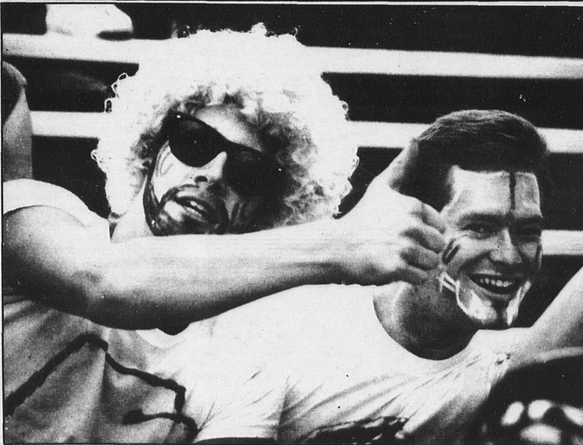
"WE'VE GOT SPIRIT, YES WE DO,..."—Two students go all out in their support of LU's football team as it played Villanova University Saturday at City Stadium.