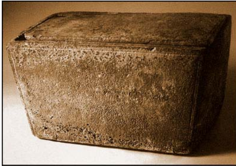
An Ancient Jewish Ossuary or "Bone Box"