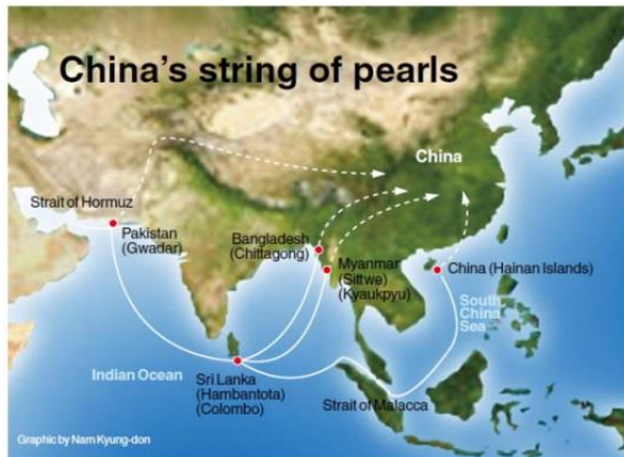
Map: "China's 'String of pearls' strategy to secure the ports of South Asia." Global Balita . http://globalbalita.com/?s=china+string+of+pearls .

influence and control is apparent in their recent port acquisitions. "China has either built or reportedly planned to construct vital facilities in Bangladesh, Cambodia, Maldives, Myanmar, Pakistan, Seychelles, Sri Lanka, and Thailand," 112 according to Patrick Mendis. These strategic port locations, known as "a string of pearls," are strategically positioned along trade routes leading from the Indian Ocean to the South China Sea. 113