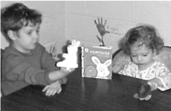
Figure 4. Young Children Enjoy Role-Playing with Puppets to Emphasize the Character Principle and Strengthen Comprehension of the Story

The teacher will read the story aloud so that everyone can experience involvement in the literature study, including younger students who are unable to read the books independently. The read-aloud technique can also be used for older students with poor reading ability. During the shared reading ex-