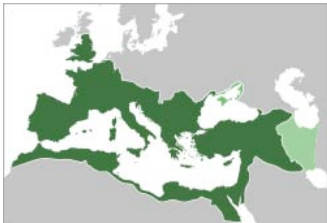
Roman Empire under Trajan AD 117