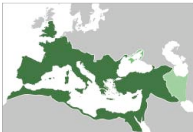
Roman Empire under Trajan AD 117